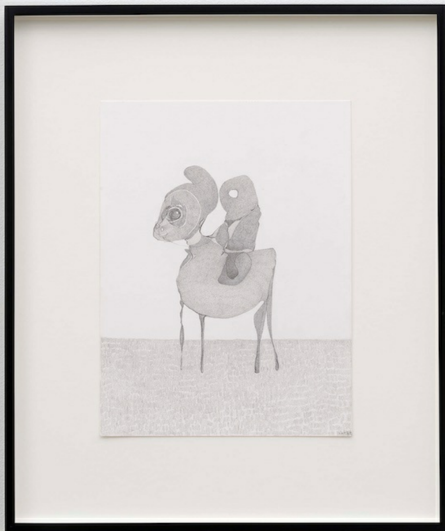
Nicola Tyson, ....and GO!, 2022, graphite on paper, 18 3/4 x 15 3/4 x 1 3/8 in (framed), 47.62 x 40 x 3.3 cm (framed), Image courtesy of the artist and Nino Mier Gallery. Photographer: Jeff McLane.