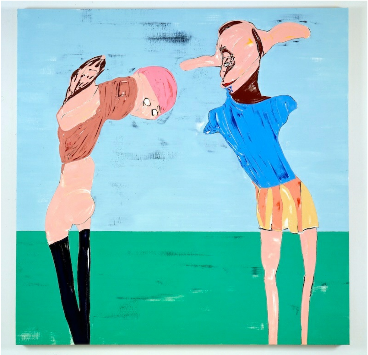
Nicola Tyson, Two Figures Dancing , 2009, oil on linen, 72 x 72 in, 182.9 x 182.9 cm, Image courtesy of the artist.

It sounds like that term, “psycho-figuration,” was your way of negotiating a new space for your work.