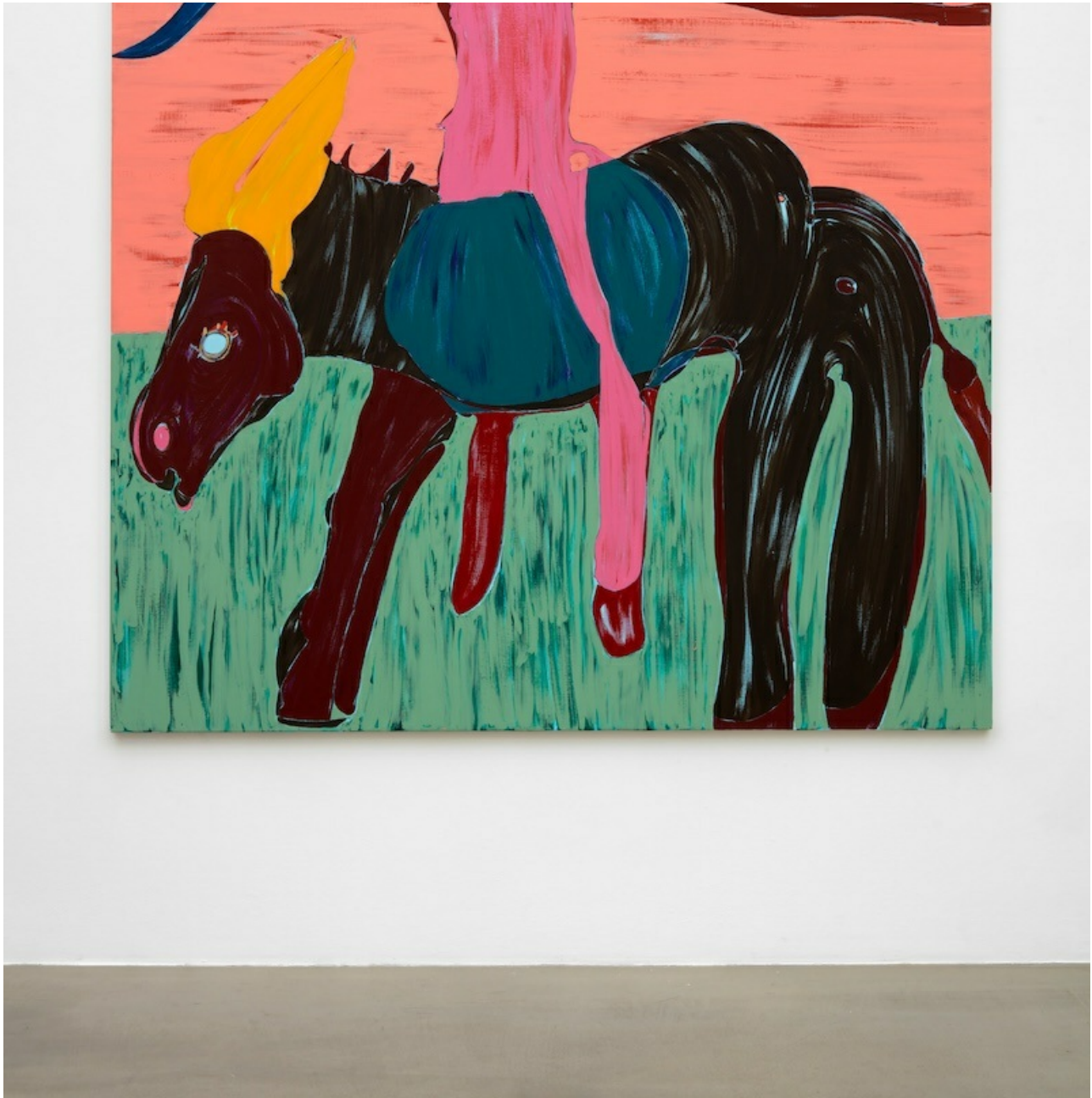
Nicola Tyson, Donkey Ride , 2021, acrylic on linen, 77 1/8 x 77 3/8 x 1 1/2 in, 196 x 196.5 x 3.8 cm, Image courtesy of the artist.

I also wanted to mention that I loved the writing in your book, Dead Letter Men .