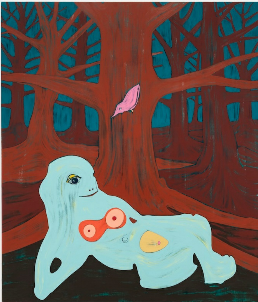
Nicola Tyson, Recliner , 2022, acrylic on linen, 77 1/4 x 66 in, 196.2 x 167.6 cm, Image courtesy of the artist and Nino Mier Gallery. Photographer: Cary Whittier.

I love the hybrid forms in your work. How do you approach representing animals or things that are non-human?