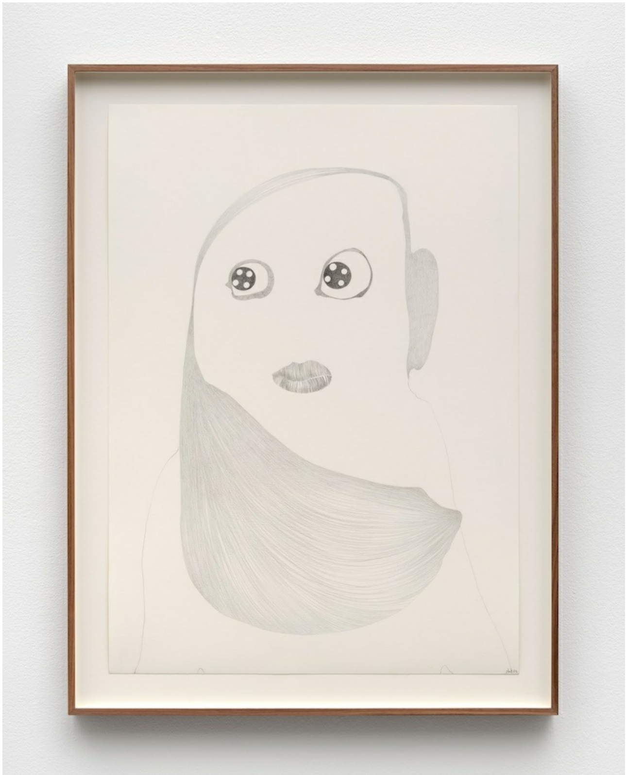
Nicola Tyson, Haircare , 2022, graphite on paper, 28 1/2 x 21 1/2 x 1 1/2 in (framed), 72.2 x 54.5 x 3.8 cm (framed),

Can you talk a bit about your exhibition space in New York in the '90s, Trial Balloon ? I'm curious how that came about and what it was like running that space.