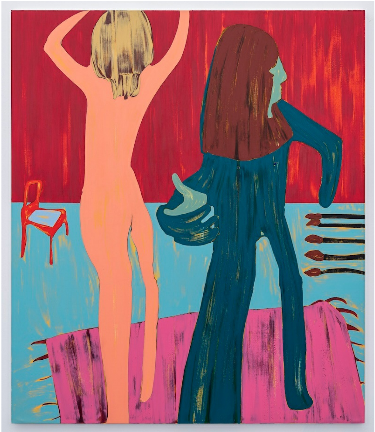
Nicola Tyson, Self-portrait: Artist and model , 2022, acrylic on linen, 77 1/4 x 66 in, 196.2 x 167.6 cm, Image courtesy of the artist and Nino Mier Gallery. Photographer: Cary Whittier.

This is helpful for me because I think I'm beginning to understand how you consider your work in relation to feminism now, how those stakes evolved over time.