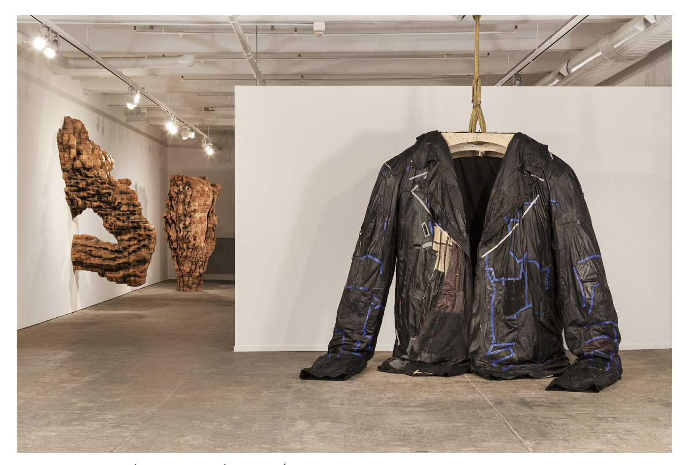
Pictured left wall: SCRATCH II, COŚ. Foreground: PODERWAĆ // PODERWAĆ, In collaboration with The Fabric Workshop and Museum, Philadelphia, 2017, Leather, cotton, steel, and polyester batting, 129 x 102 x 45 inches. /// SCRATCH II, 2015, Cedar, graphite, 10 feet 9 inches x 8 feet 6 inches x 3 feet 9 inches, Courtesy Ursula von Rydingsvard and Galerie Lelong & Co., New York. /// COŚ, 2017, Cedar, graphite, 9 feet 2 inches x 4 feet 4 inches x 2 feet 11 inches, Courtesy Ursula von Rydingsvard and Galerie Lelong & Co., New York.