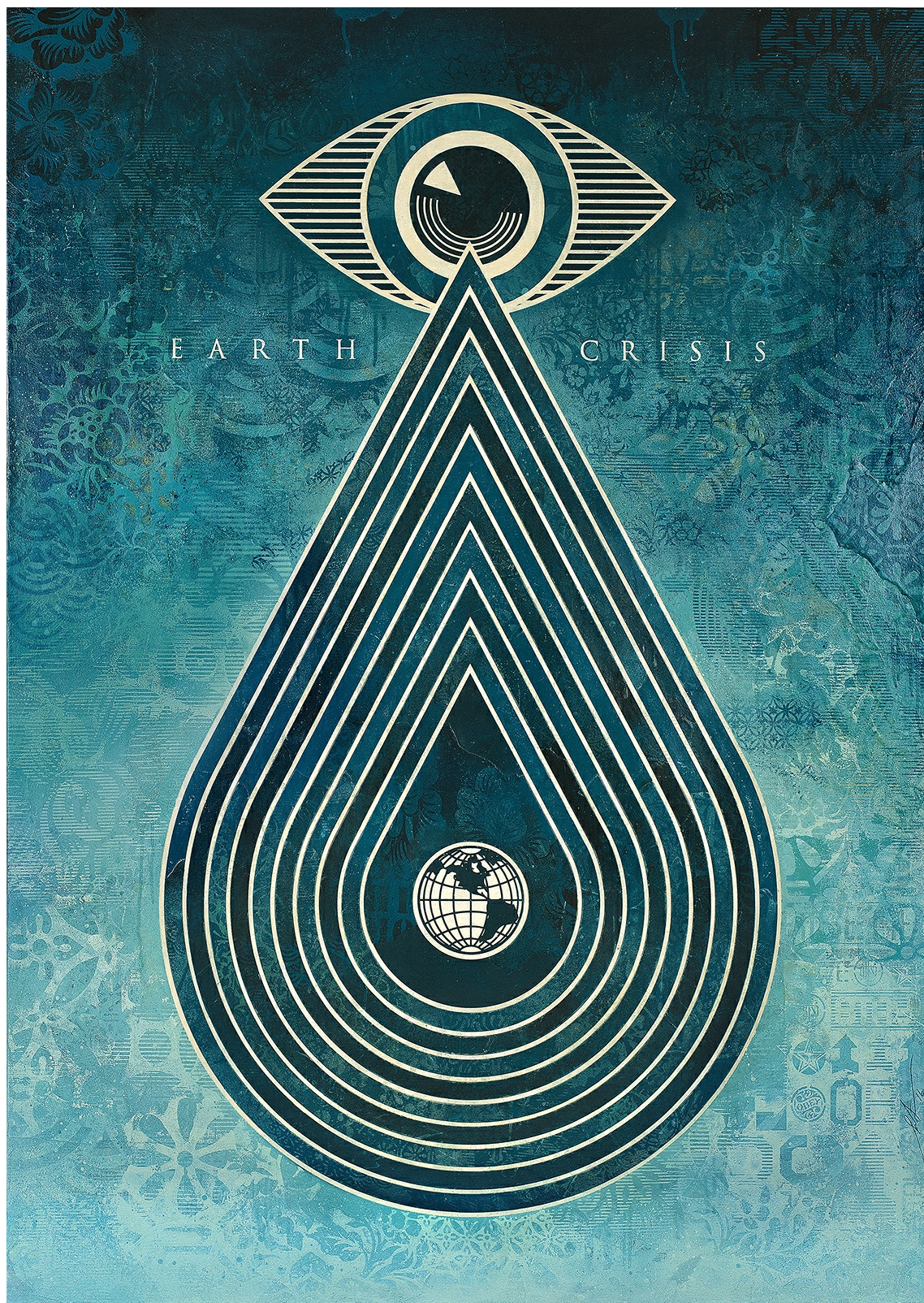
Shepard Fairey, Earth Crisis, Version 2 , 2016, Mixed Media, (Stencil, Silkscreen, and Collage) on Canvas 44 x 60 in. (111.8 x 152.4 cm), Art courtesy of Shepard Fairey/ObeyGiant.com