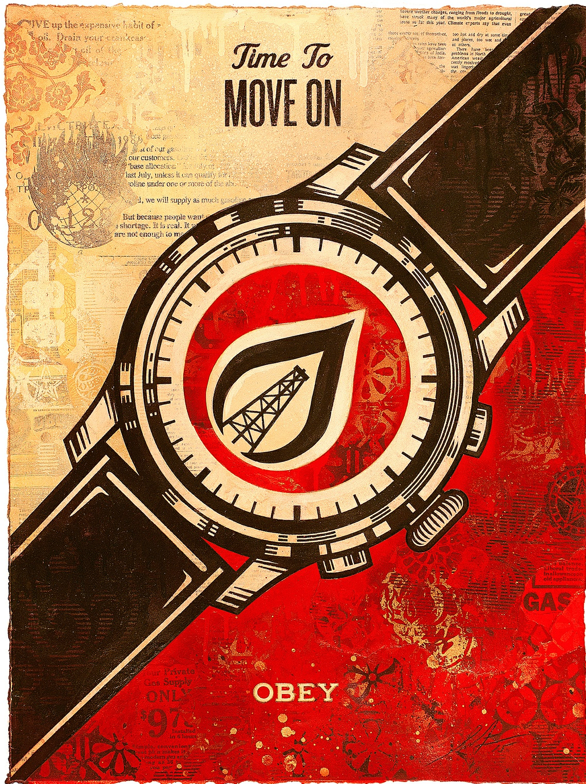
Shepard Fairey, Time To Move On Study, 2015, Mixed Media (Stencil, Silkscreen, and Collage) on Paper 18 x 24 in. (45.7 x 61 cm), Art courtesy of Shepard Fairey/ObeyGiant.com

The current election quickly moved away from the issues to personalities. Is this also part of what inspired you?