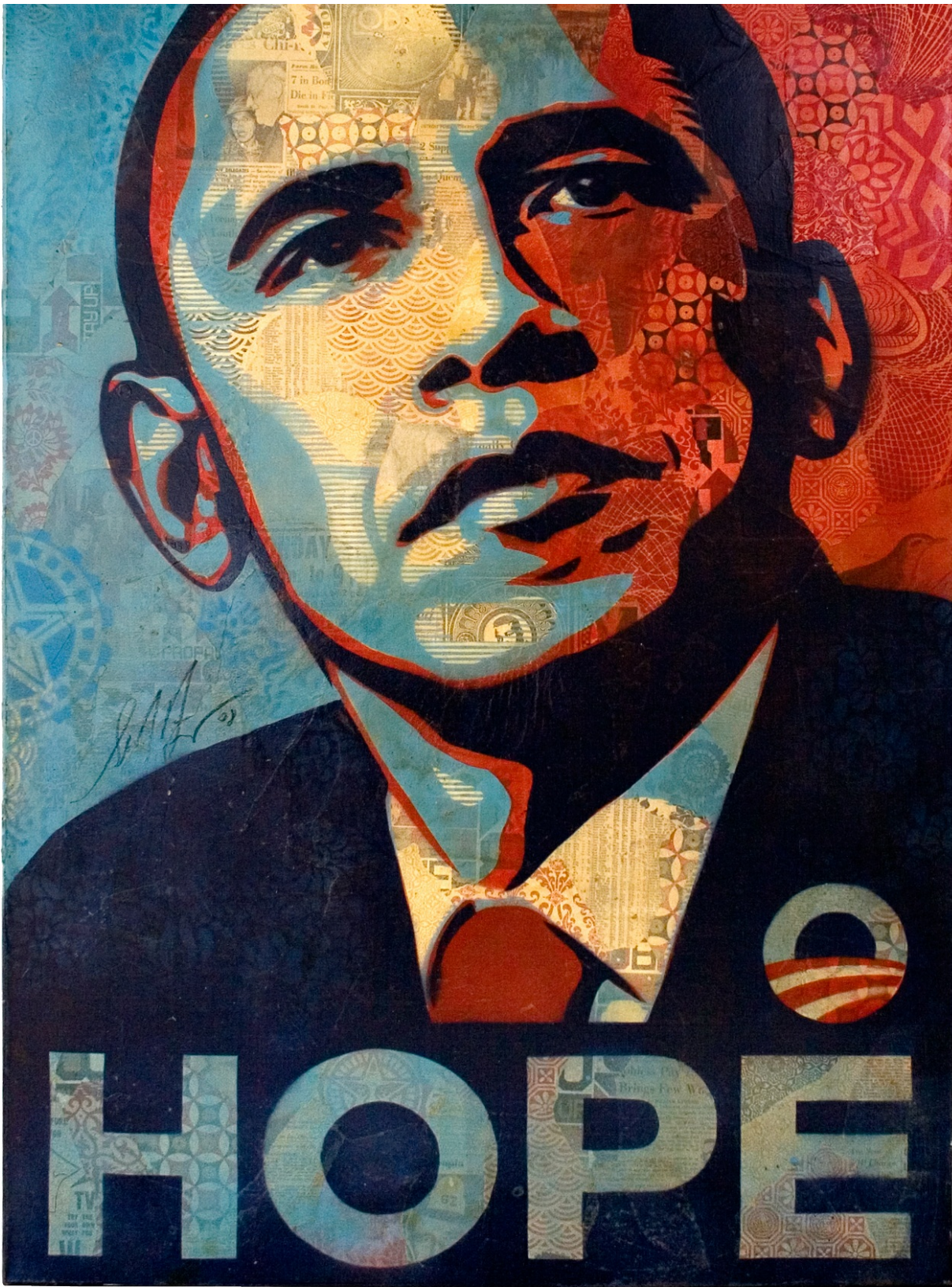
Shepard Fairey, Obama Hope, Version 1, 2008, Mixed Media (Stencil, Silkscreen, and Collage) on Canvas 48 x 72 in. (121.92 x 182.88 cm) Art courtesy of Shepard Fairey/ObeyGiant.com