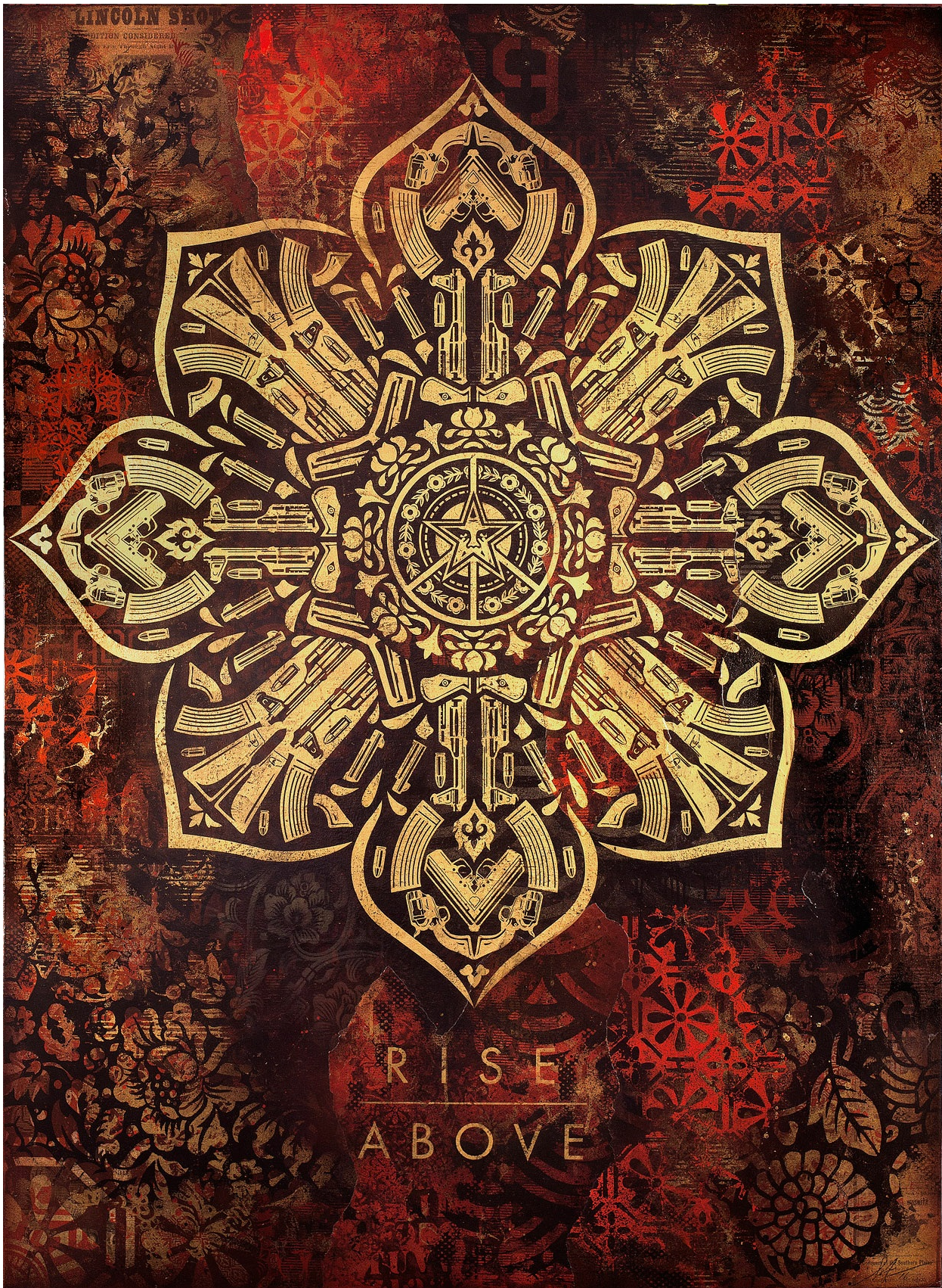
Shepard Fairey, Rise Above (Caliber) , 2016, Mixed Media (Stencil, Silkscreen, and Collage) on Canvas 44 x 60 in. (111.8 x 152.4 cm), Art courtesy of Shepard Fairey/ObeyGiant.com