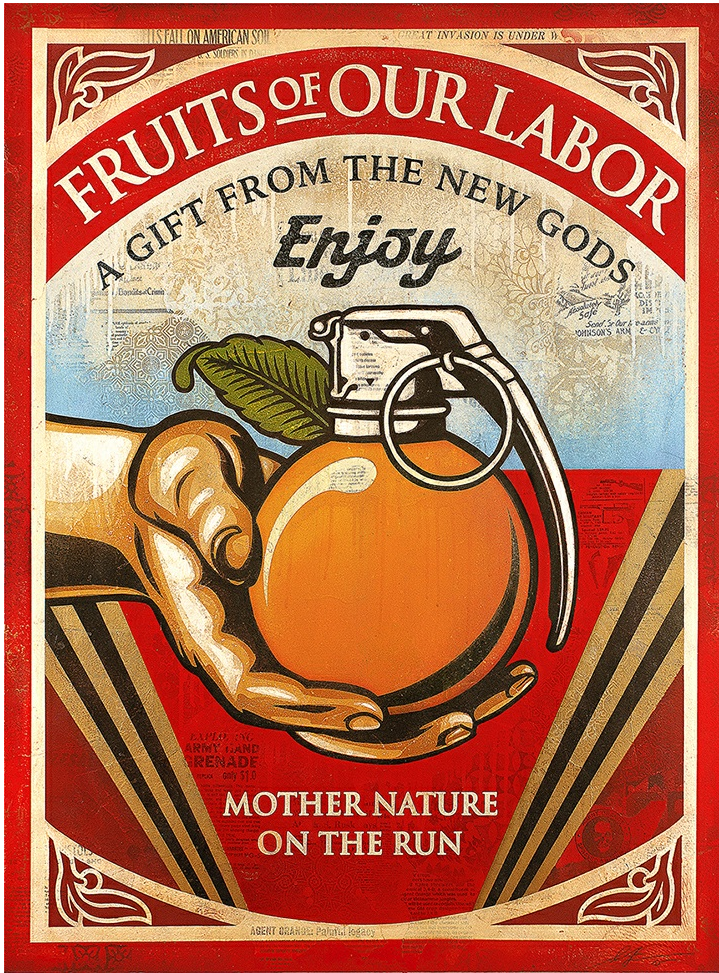
Shepard Fairey, Fruits of our Labor , 2015, Mixed Media (Stencil, Silkscreen, and Collage) on Canvas 30 x 40 in. (76.2 x 101.6 cm), Art courtesy of Shepard Fairey/ObeyGiant.com