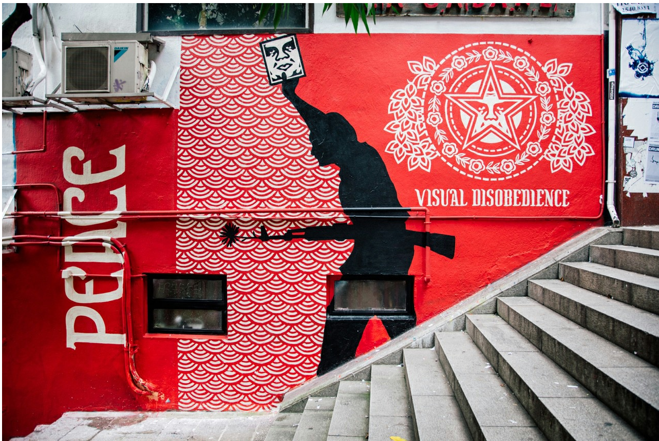
Visual Disobedience Mural Hong Kong, 2016

In terms of achieving what I'd like to achieve with my art—which is to encourage someone to think about an issue in a way they may not have—finding evocative imagery and symbols that can translate complex ideas in relatable ways is far more challenging than making portraits. At the same time, there may be no more effective means of impacting things—socially, politically, and conceptually—than portraits that potentially appeal in a more shallow way. Don't get me wrong; I love the superficial as much as the next person, but I also like to weave in substance.