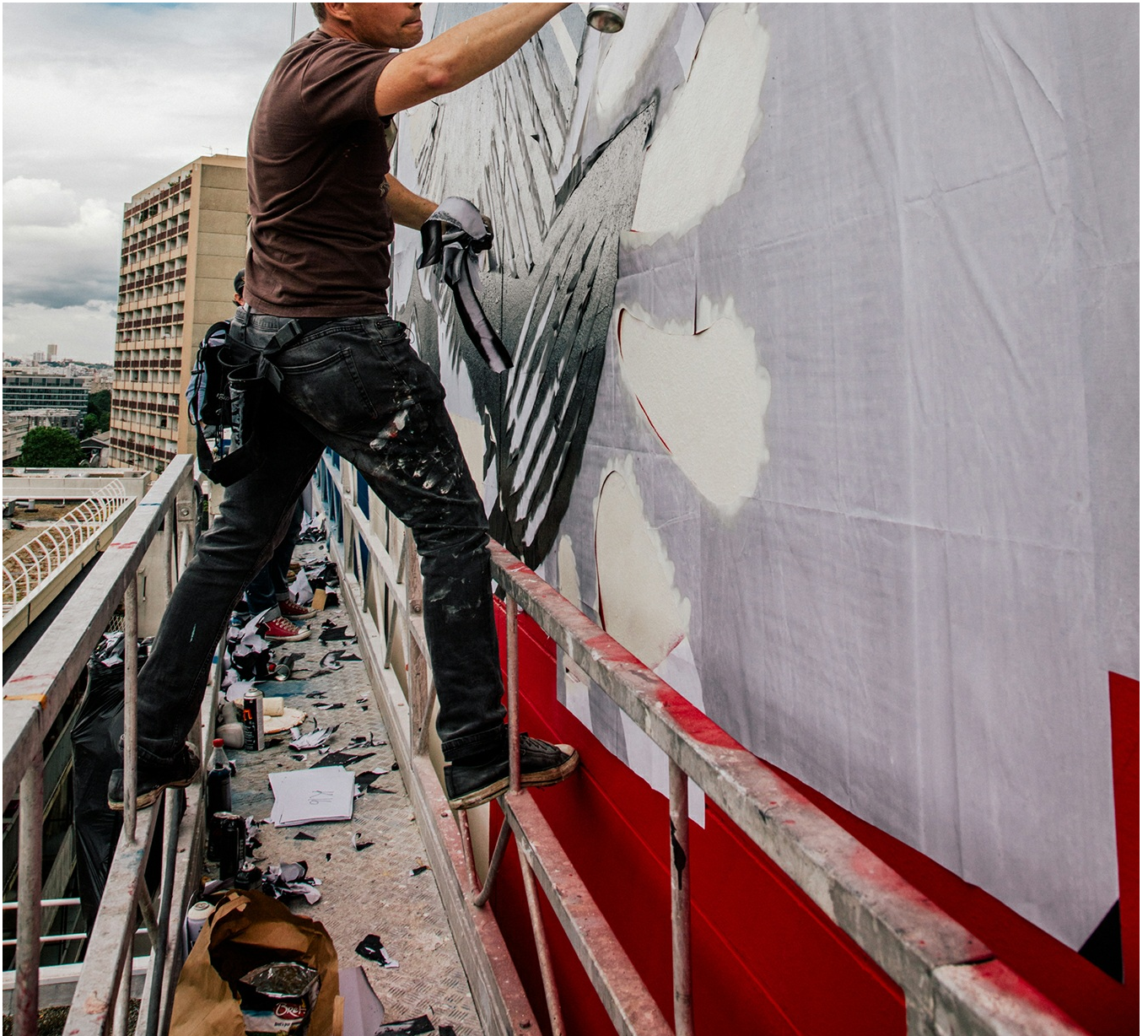
Art courtesy of Shepard Fairey/ObeyGiant.com