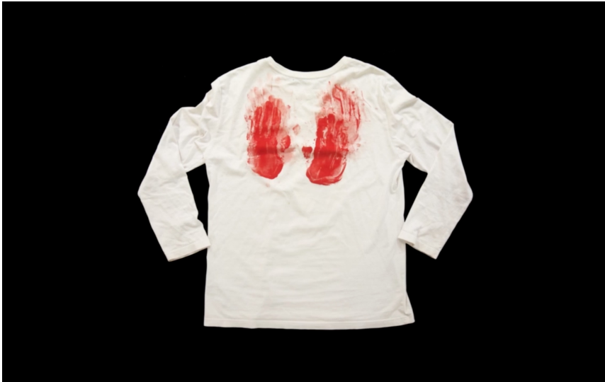
Still from Art Production Line , 2015