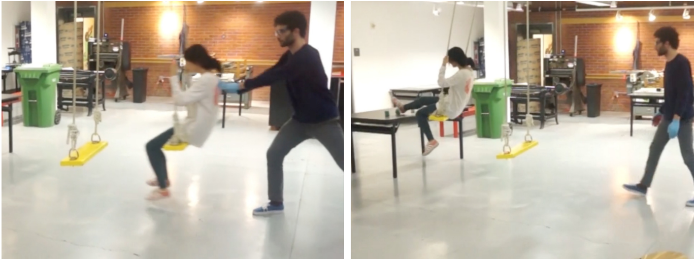
Stills from Art Production Line , 2015