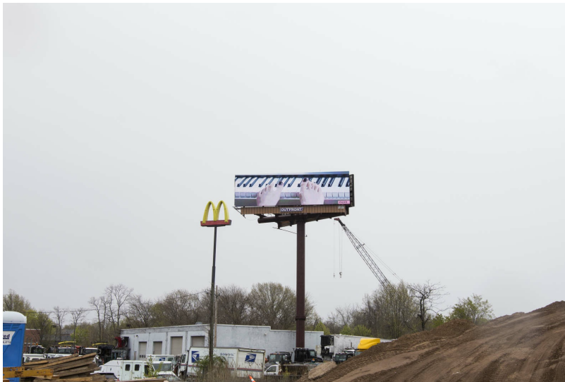
MORE Digital Billboard, 2016

When I'm alone, I become more sensitive to my surroundings. I am more aware of my path, if I like the color of this building, or if I remember that dirty plastic bag floating under the sunshine and onto the mud. If I were with a group, I might not notice these things because you need to talk to people and follow the group. I like to have my own pace and rhythm and not worry about following or catching the group. When I'm alone, I feel like a human camera.