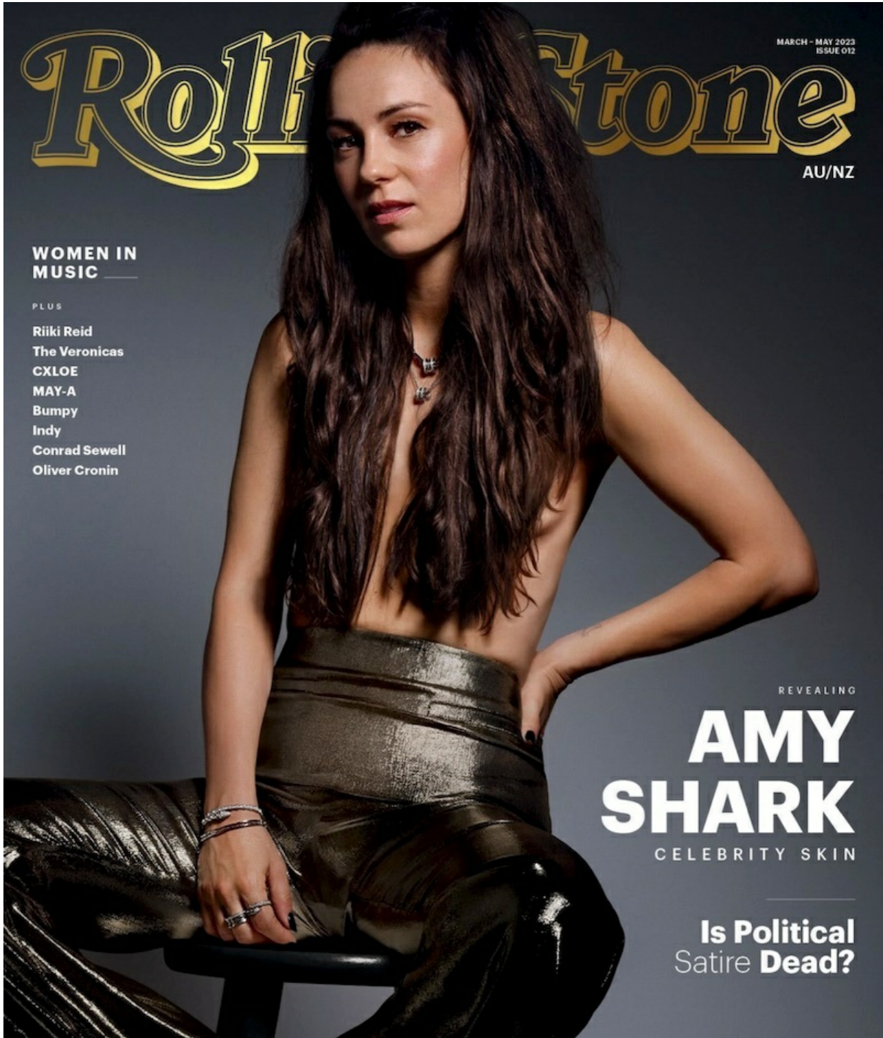
Amy Shark for Rolling Stone

Did you have side hustles along the journey in order to make it?