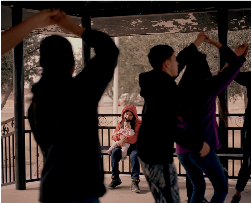
Kids at Quince Practice, 2020

encourage them to dream of one. Again, there's not really an artistic community here and I want to be a part of that in some way, facilitating creativity in some way.