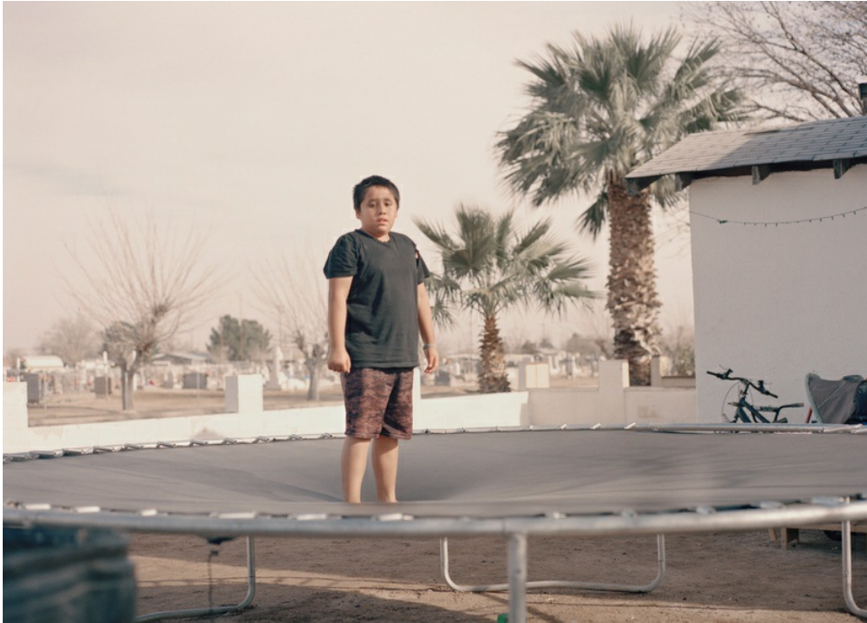
Natividad Boy, 2020