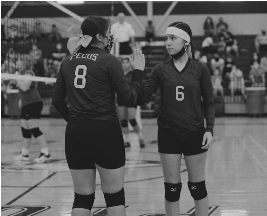
Volleyball Eagles, 2020

I think a lot about when I moved to Buffalo six years ago before grad school, and kind of just landing there and not having friends or a job, and finding my own way there. [I remember] being introduced to the roller skating scene in Buffalo through a friend, and wanting so bad to be a part of something there—getting to know people, getting to know the skaters, and feeling a sense of belonging during a special time in my life. What I look for in a community is being there for each other and helping one another. I remember there was one skater who was like, “I see your tenacity, girl! Let me help you.”