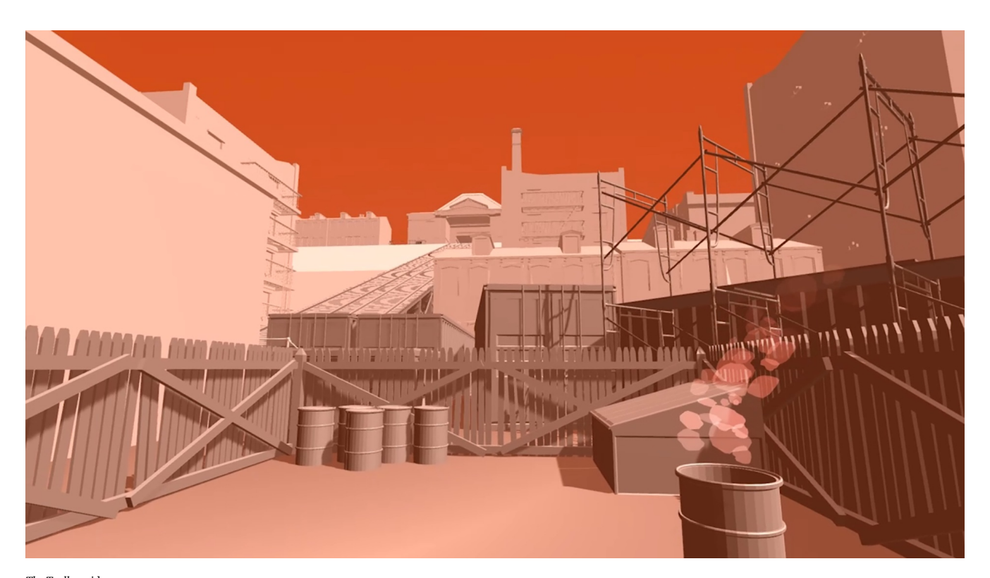
The Trolley, video game, 2017

More recently, I think a lot of my work has been based in conversation. So when I'm starting to feel fatigued from screen time-especially when I'm working on 3D animation, or when I'm working on something that's rendering-intensive—I call someone and continue the research side of what I'm looking at. Or, maybe I'll have someone over for a studio visit to just look at the stuff I'm thinking about or mulling over. Or, I meet up with a good friend. I guess the way that I battle fatigue is by returning to the conversations that I'm hoping that the work is having, and then trying to see if that conversation can re-inspire me. So yeah, I do get fatigued a lot of the time, especially when a lot of my entertainment comes from screens, too.