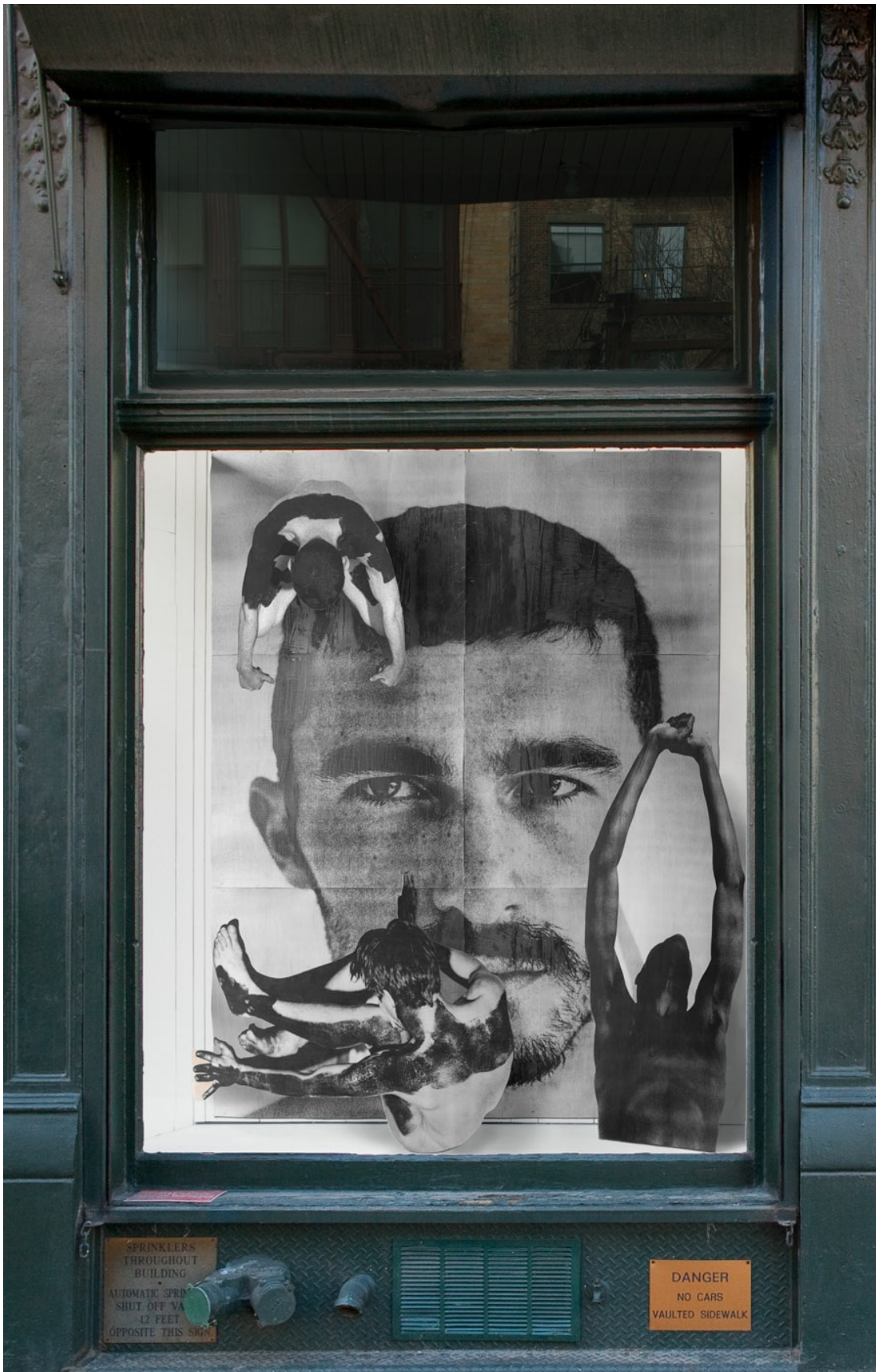
Installation, 39 Great Jones Street, 2017