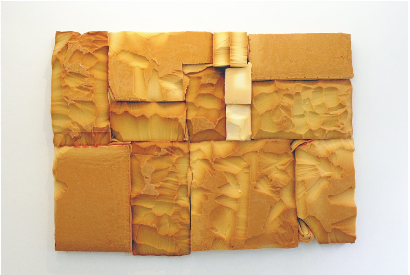
POUNDCAKE, 2016. Cut upholstery foam on wood board.

That blew my mind because I could think of a it as a sculptural object: making a show. Not trying to create this buzz or connect with this particular curator. I'm like, well if you make a show you don't need to have this background in art history. You could construct it the way you would do any other kind of work. That gave me confidence to make something and understand that whether it was an article or an essay or a sound piece or a more traditional exhibition, I could be as present and participatory as I would be if I decided to make something in my studio.