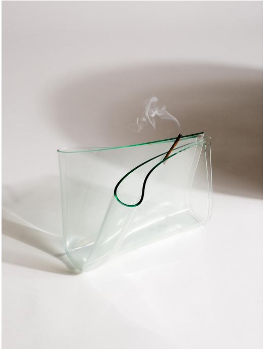
They say it's like a rock, 2015. Glass from a window facing south and Nag Champa incense. 21 x 29 x 24 cm.

I read about your piece in which you asked a musician if you could borrow two of her piano keys for your piece. Is it difficult to negotiate the borrowing for your work?