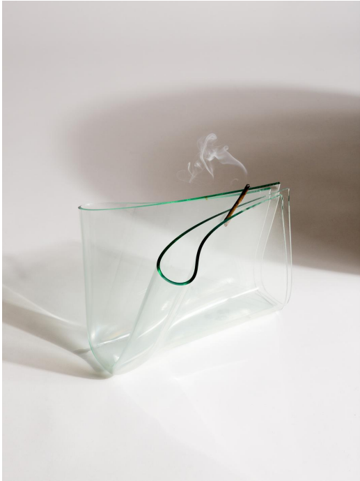
They say it's like a rock, 2015. Glass from a window facing south and Nag Champa incense. 21 × 29 × 24 cm.

I read about your piece in which you asked a musician if you could borrow two of her piano keys for your piece. Is it difficult to negotiate the borrowing for your work?