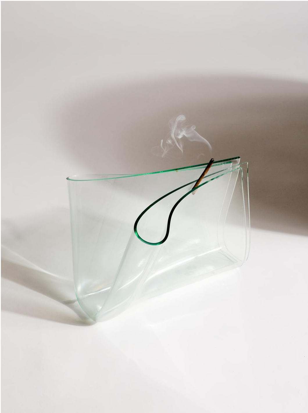
They say it's like a rock , 2015. Glass from a window facing south and Nag Champa incense. 21 × 29 × 24 cm.

I read about your piece in which you asked a musician if you could borrow two of her piano keys for your piece. Is it difficult to negotiate the borrowing for your work?