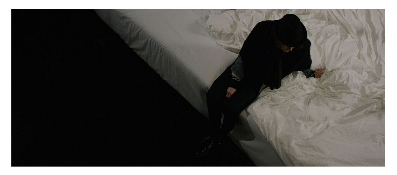
You were making a documentary about Broder Daniel, a band that a lot of people outside of Sweden don't know about. I imagine that made it complicated, too.

The big struggle for us, as far as grants and funding institutions, is that they're looking for a very specific type of project, which is more politically active and social-justice facing. They all fit whatever message the institution is trying to send. It's hard to get an art film funded.