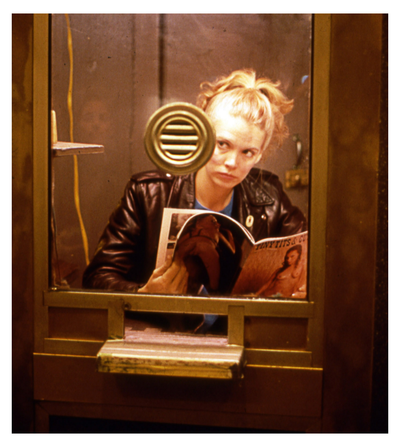
Still from Variety, shot by Nan Goldin

How do you do that? When this is your medium and there are these gaps of time between projects-where you're writing, gathering resources, trying to get funding, etc—how do you sustain yourself creatively?