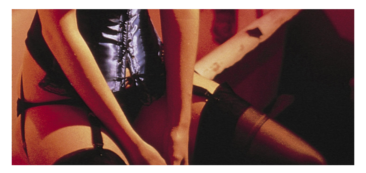
Still from Variety, shot by Nan Goldin

I think so. Especially given the accessibility of digital technology, there are lots of kids just out there making stuff. People trying to circumvent the system, which can also be a good thing.