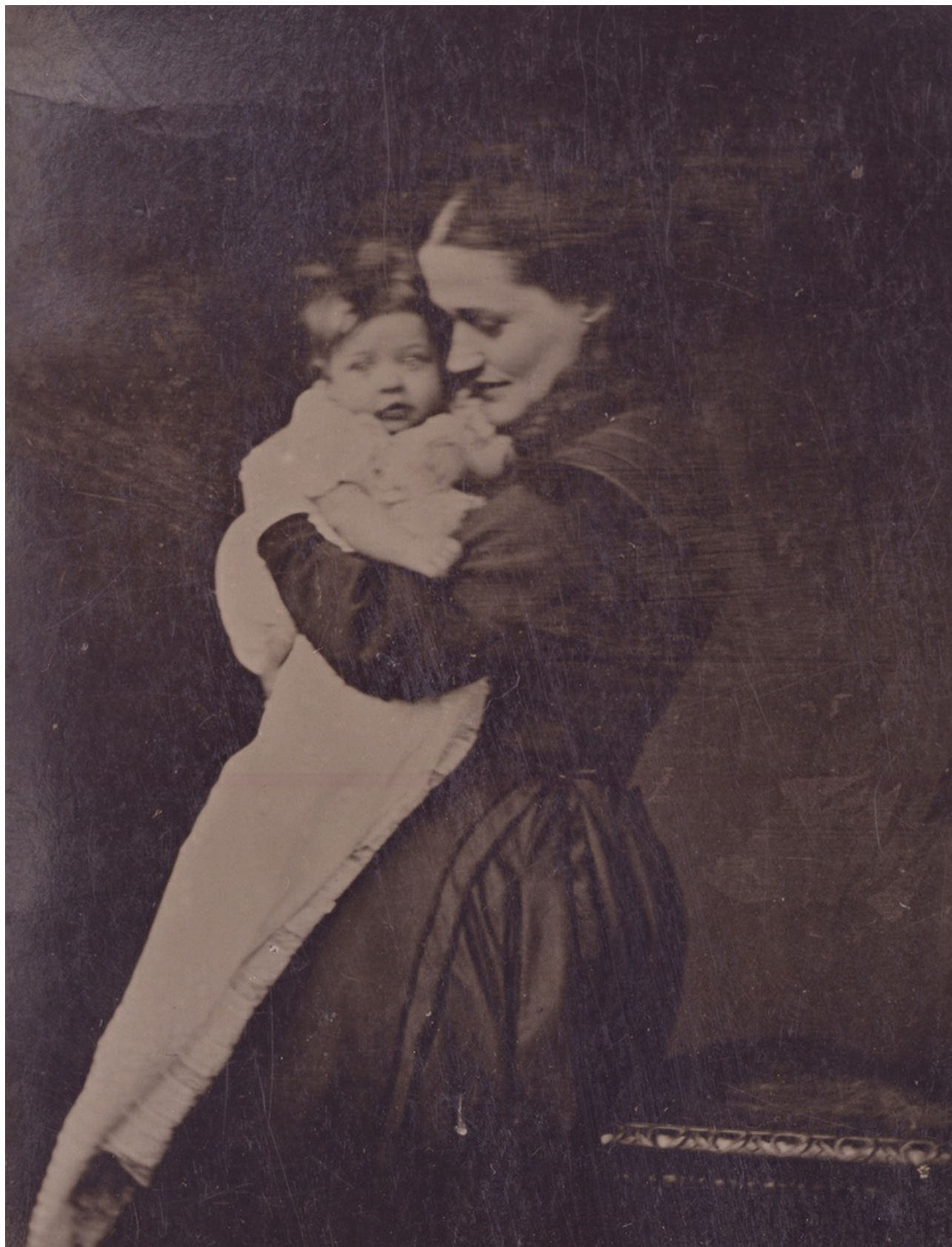
Cherish © Stacy Renee Morrison