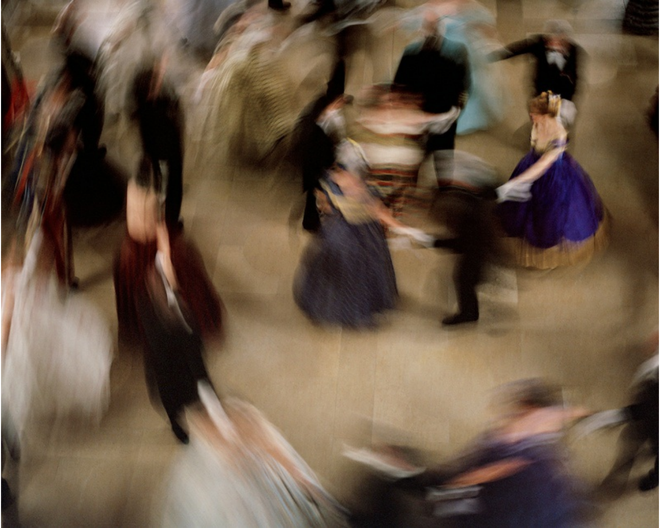
October 18, 1860

Yes, exactly. Reimagining history takes on various forms. I am a fact-finder and an architect of historical fiction in my work. I am a strong believer in the ambiguity of the photographic image. I think the very same photograph can present both a truth and a fiction. All of my photographs do just this. They are the truth, but they are not all truthful. I am photographing memories, but they're not my own. I think of my photographs as a time machine.