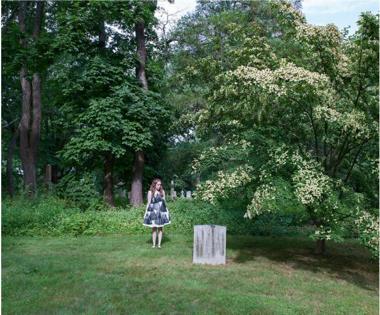
Sylvia's Dresses