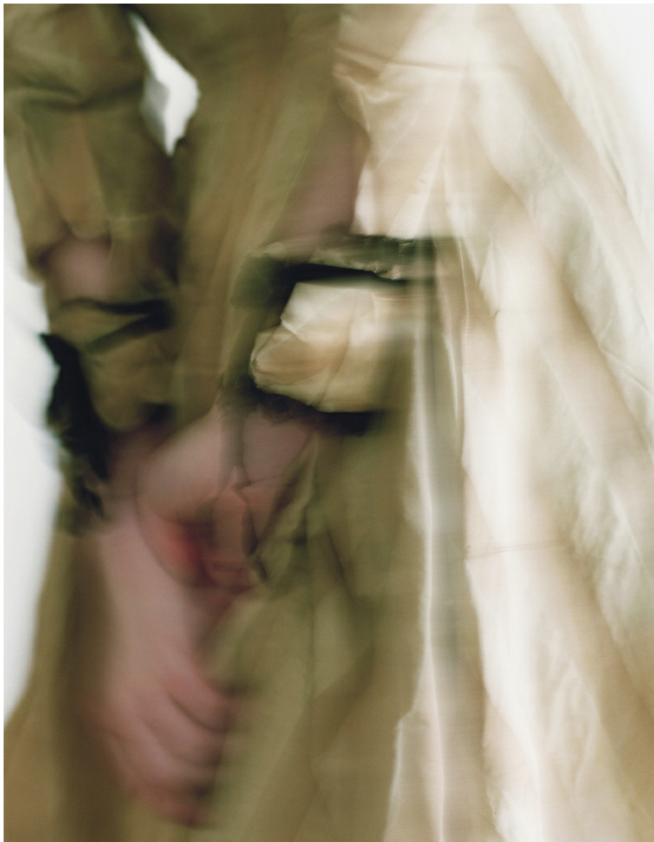
Becoming © Stacy Renee Morrison

Your images represent what Sylvia would have seen or experienced herself, and sometimes they seem to represent