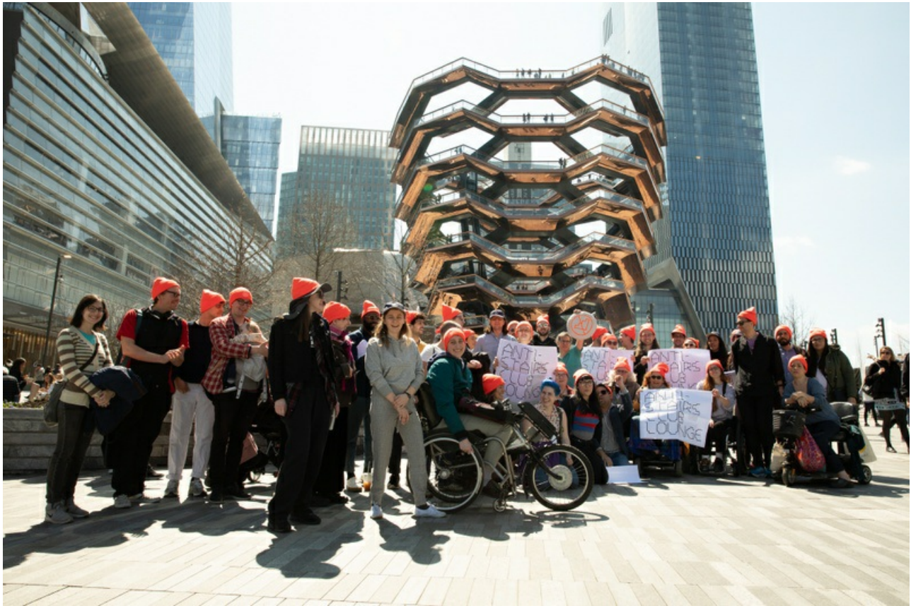
Caption: Anti-Stairs Club Lounge at the Vessel , 2019. Image description: About 40 people posed in front of the Vessel sporting neon orange, Anti-Stairs Club Lounge beanies and holding Anti-Stairs Club Lounge signs.

I see several of your projects, like Museum Benches [a series of blue benches with text on them such as, "This exhibition has asked me to stand for too long"], as invitations to build solidarity and community. Can you talk a bit about how and why you invite people into your work?