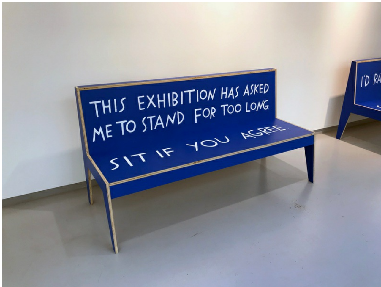
Caption: Do you want us here or not 1 , 2018 Image description: A blue bench with hand-painted text that reads, "This exhibition has asked me to stand for too long. Sit if you agree."