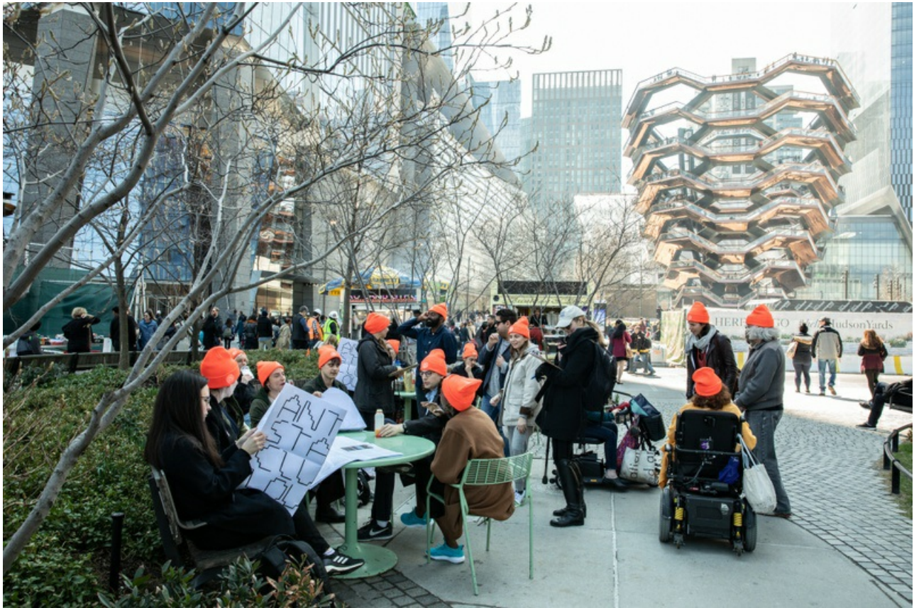
Image description: A group of about twenty people lounging in front of the Vessel. They are sitting, chatting, and reading. All wear bright orange Anti-Stairs Club Lounge beanies.

There were a lot of constraints in terms of who could participate in that project. I didn't want to announce it publicly because I didn't know how Related [the real estate company that owns and operated the Vessel] would respond, so in this case I was activating my personal network. I was focused on disabled people and non-disabled people who I knew who were invested in disability culture and accessibility, or who were already involved in that work because I didn't want the project to be about explaining why we were there or trying to justify why we were frustrated or upset about the Vessel. I wanted it to be a chance to be together in that frustration and anger. I also wanted the project to demonstrate how I want to use public space—I want to be able to gather, I want to be able to hang out, I want to lounge. The best part of the protest was thinking through questions like, "How would we want to use this space? What do we want from public space?" And then demonstrate that through the Club Lounge .