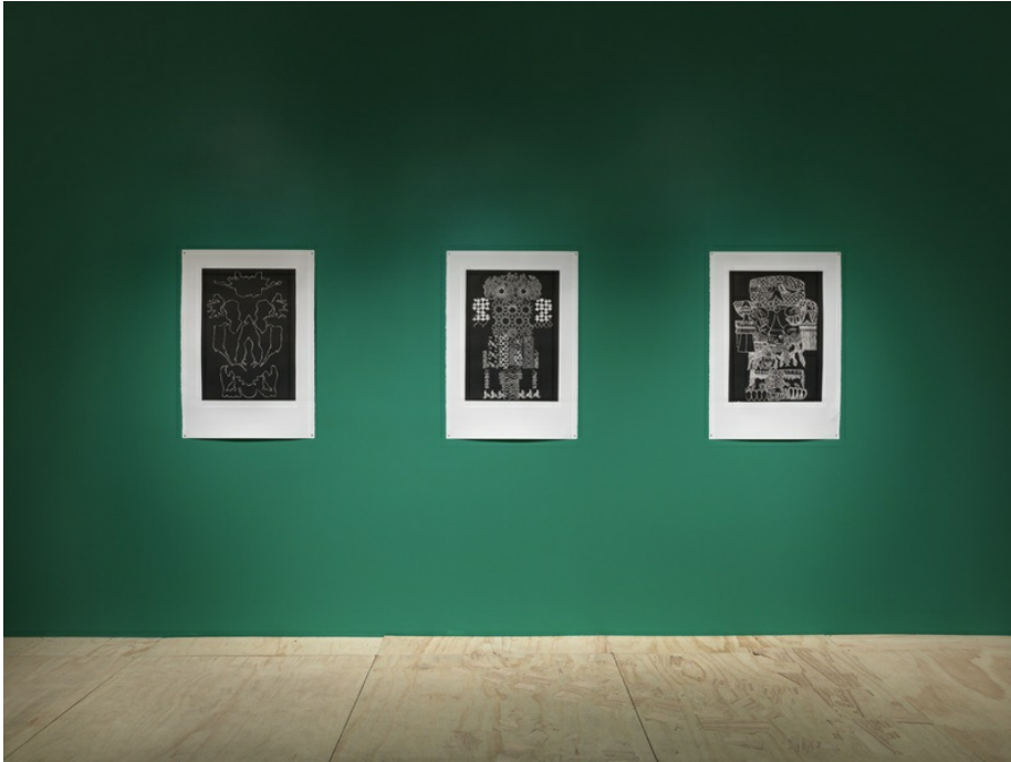
Mariana Castillo Deball: Finding Oneself Outside, 2019. Exhibition view: New Museum, New York.

I've read some amazing books lately. I got really into Octavia E. Butler and I've read many of her science fiction books, particular her book Kindred . I also recently read a great book by the Mexican writer Valeria Luiselli. Her last novel is called Lost Children Archive , it's an amazing book. Oh, and another book that I really like is There There , from a Native American writer named Tommy Orange. It's a beautiful novel. Read those.