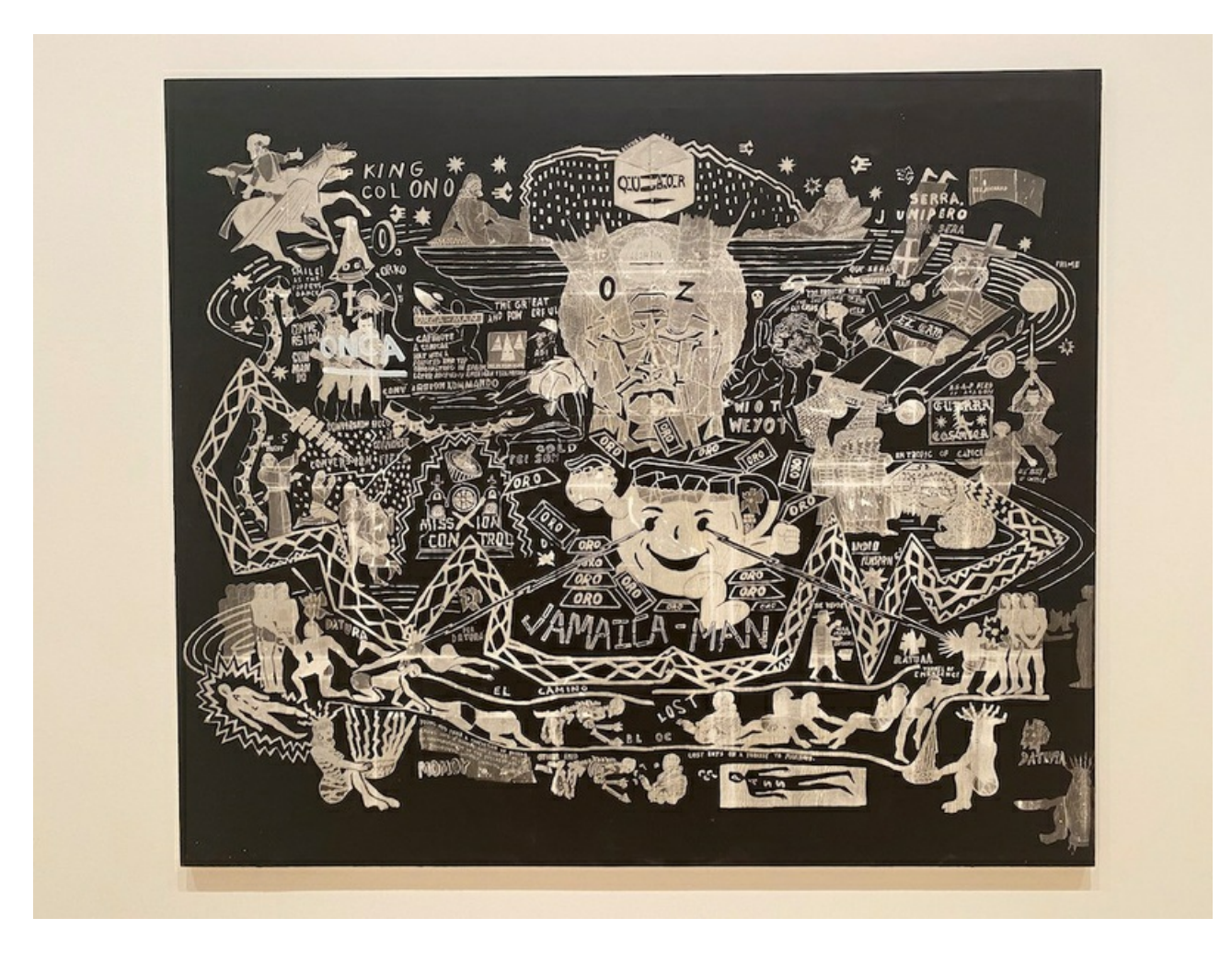
from Umar Rashid, Battle of Malibu (In Three Parts) 179