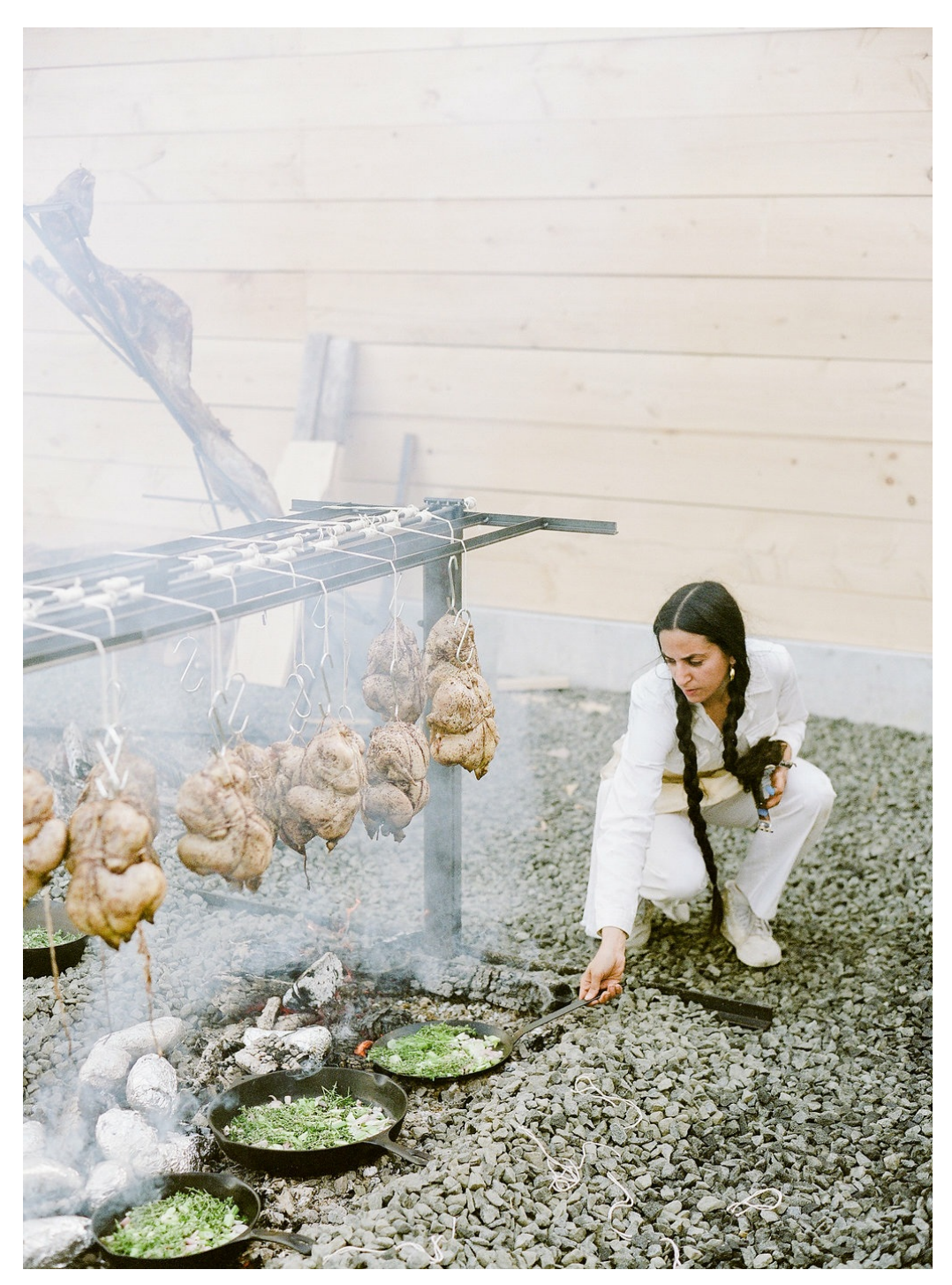
Cooking my annual Summer Solstice Celebration Dinner at 99Scott in Brooklyn, 2017