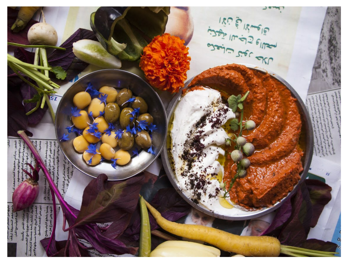
Dips from my Palestinian Dinner Residency held at The Dimes Deli in NYC July 2017

There's the art world that we know-it's institutional and based on a kind of education without which you aren't able to understand most contemporary art. It therefore makes it so alienating to 99.5% of the population on earth. To me, art is a language, and it ought to communicate to the largest number of people possible. If you have to understand Foucault to be able to understand a painting, how many people can understand it? Obviously some, but most people don't. That seems so exclusionary to me in a way that I don't accept.