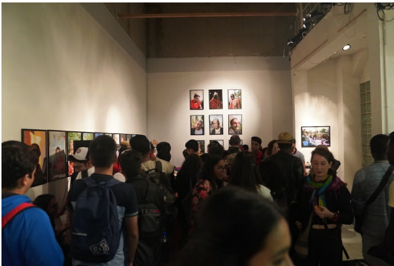
Salade de racines - Installation hospitalière - 2019