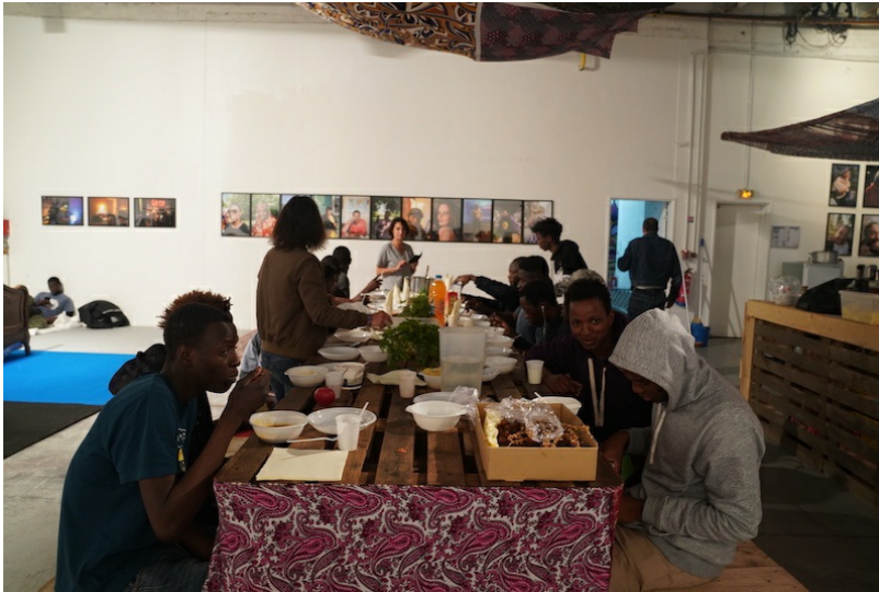
Salade de racines - Installation hospitalière - 2019