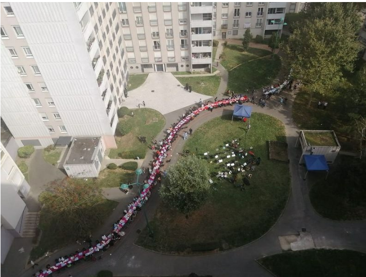
Test La plus grande table du monde cité Soubise- Saint-Ouen - Septembre 2021 - Compagnie Perdue dans la baignoire

When I create something I want it to be fun and accessible. It needs to be something that doesn't need my direction, something that can be done without having knowledge about art. It's also always a research process. I try to open the world of the contemporary art. I want to investigate how we can achieve more togetherness, how the participants can feel happier by being part of an art project, and how they will feel a part of it and not just feel like spectators.