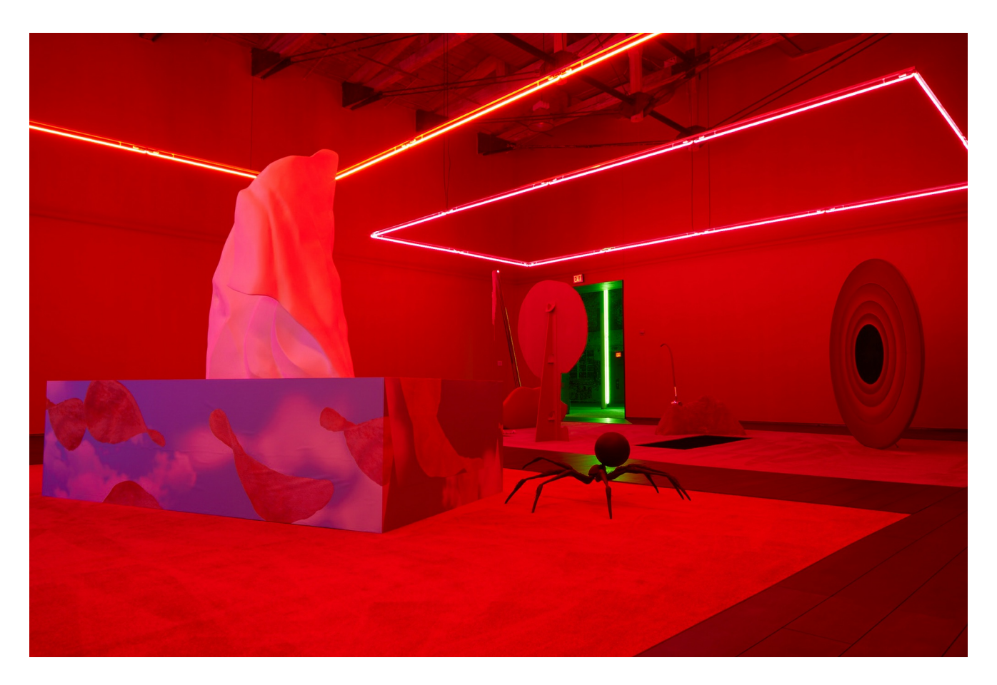
Free Roses, MASS MoCA, North Adams 2016

For that particular case, I think it was less about we don't want our artwork shown as much as it was about originally appealing to her to say if you collect the artworks of these people of color and people who are gay and people whose politics are in some ways in opposition to yours or your father's, recognize that and speak to that, or be a hypocrite.