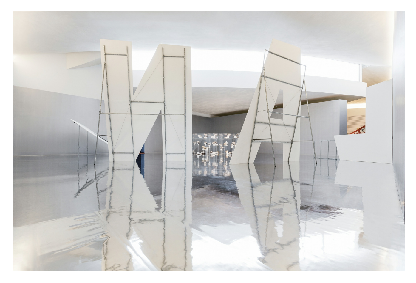
50 Wigs, Herning Museum of Art, Denmark 2016

Not understanding where one's work came from fascinates me. Does that mean it's an intuitive process to some extent? Are there ever planned things along the way that you want to hit?