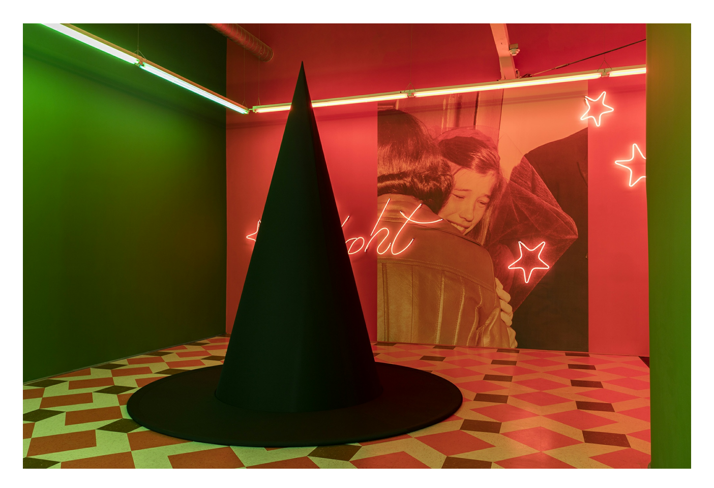
Season In He'll, Art & Practice, Los Angeles 2016