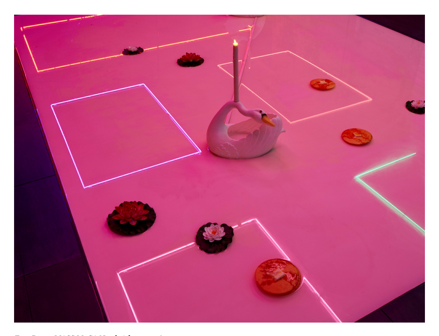
Free Roses, MASS MoCA, North Adams 2016

You grew up outside of Philadelphia, went to school in New York City, and then moved back to Philadelphia. What aspects of living in Philadelphia accommodate you as an artist?