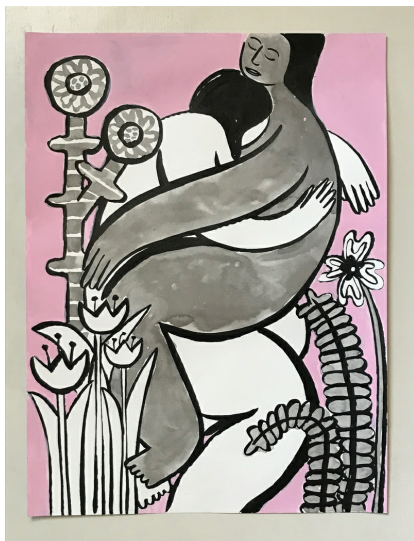
Lady comfort in flowers with pink, 2019 sumi ink and acrylic on arches cold press 18x24

sleep, I dream of times when we were close; times in the future when we may come back together. And sometimes, what is real in my mind is more real than what is actually going on outside.