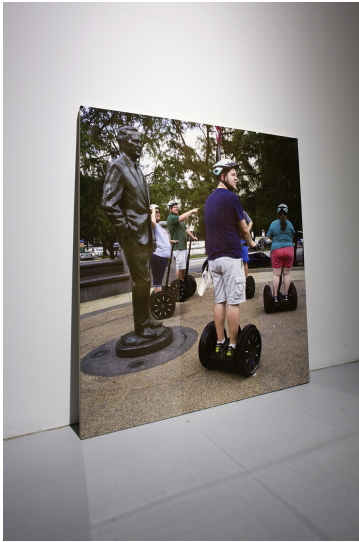
Yoshua Okón: Miasma , on display at Parque Galería 07 Feb 2017 – 28 Feb 2017, Photo by Ramiro Chaves

to give context. So I thought back to these photos of the tourists and decided to use them as a way to contextualize. So, originally, I didn't take them for any other reason than they were funny, and I ended up incorporating them into the exhibition. These tourists symbolize the passive consumer of neoliberal capitalism.