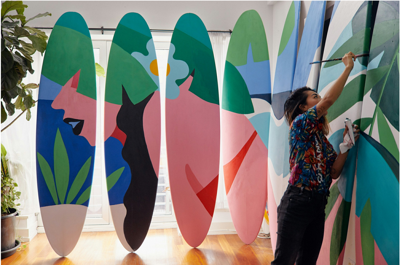
Surfboard for the W Hotel

On a deeper level, there's something about sadness I connect to, and I love creating for that specifically. I resonate with people who have grown up marginalized and lost, and those who deal with a sense of sadness about it all, underneath all the layers; that's a large root of my work. On the external level, I connect with people who are first- or second-generation immigrants, people who connect with a culture outside of the trend. Lately I have been identifying more as a woman, too, in a way that I never thought I did before. Before, I felt genderless, as I was brought up to not think of gender so distinctly.