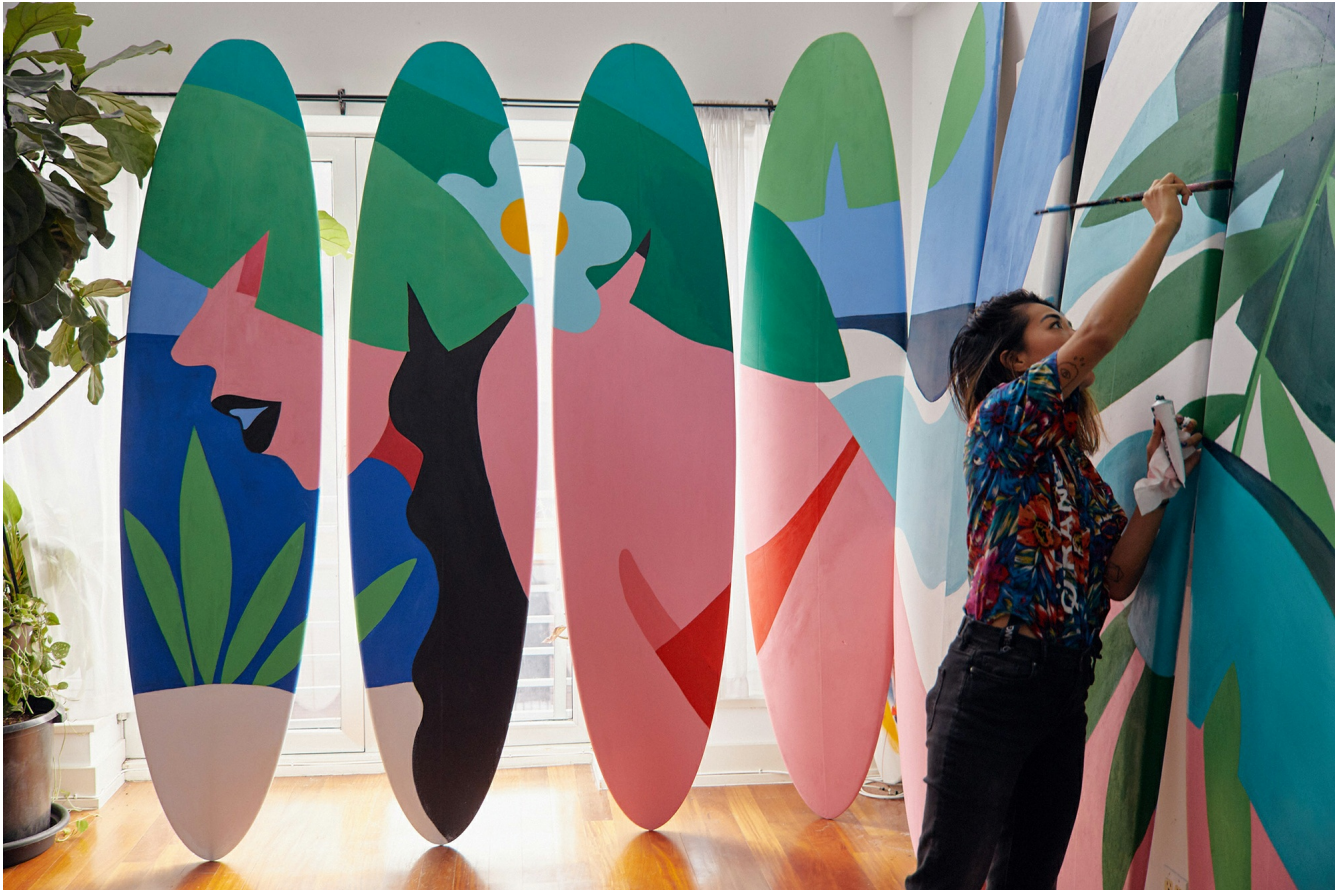
Surfboard for the W Hotel

On a deeper level, there's something about sadness I connect to, and I love creating for that specifically. I resonate with people who have grown up marginalized and lost, and those who deal with a sense of sadness about it all, underneath all the layers; that's a large root of my work. On the external level, I connect with people who are first- or second-generation immigrants, people who connect with a culture outside of the trend. Lately I have been identifying more as a woman, too, in a way that I never thought I did before. Before, I felt genderless, as I was brought up to not think of gender so distinctly.