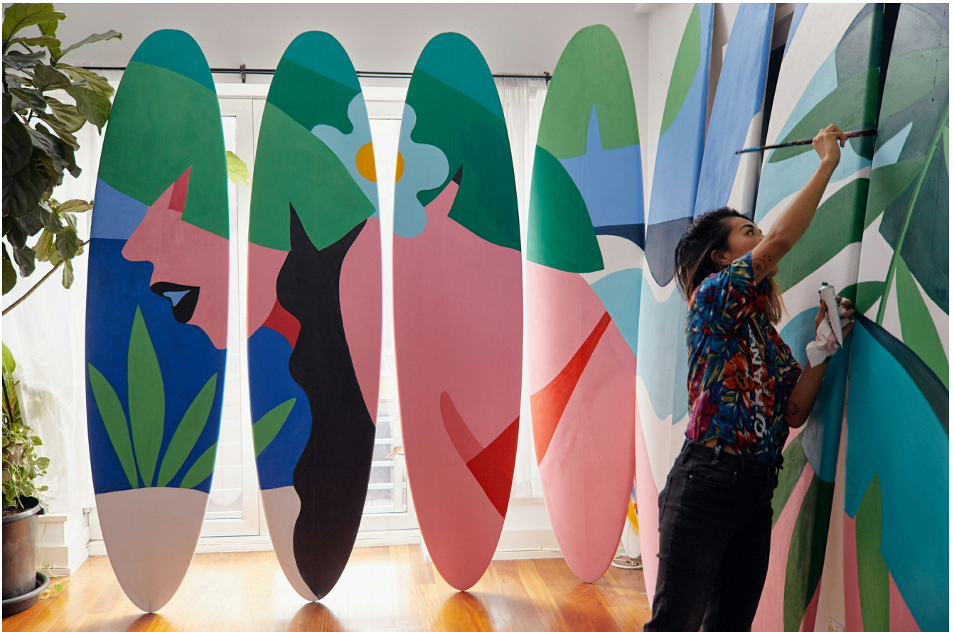
Surfboard for the W Hotel

On a deeper level, there's something about sadness I connect to, and I love creating for that specifically. I resonate with people who have grown up marginalized and lost, and those who deal with a sense of sadness about it all, underneath all the layers; that's a large root of my work. On the external level, I connect with people who are first- or second-generation immigrants, people who connect with a culture outside of the trend. Lately I have been identifying more as a woman, too, in a way that I never thought I did before. Before, I felt genderless, as I was brought up to not think of gender so distinctly.