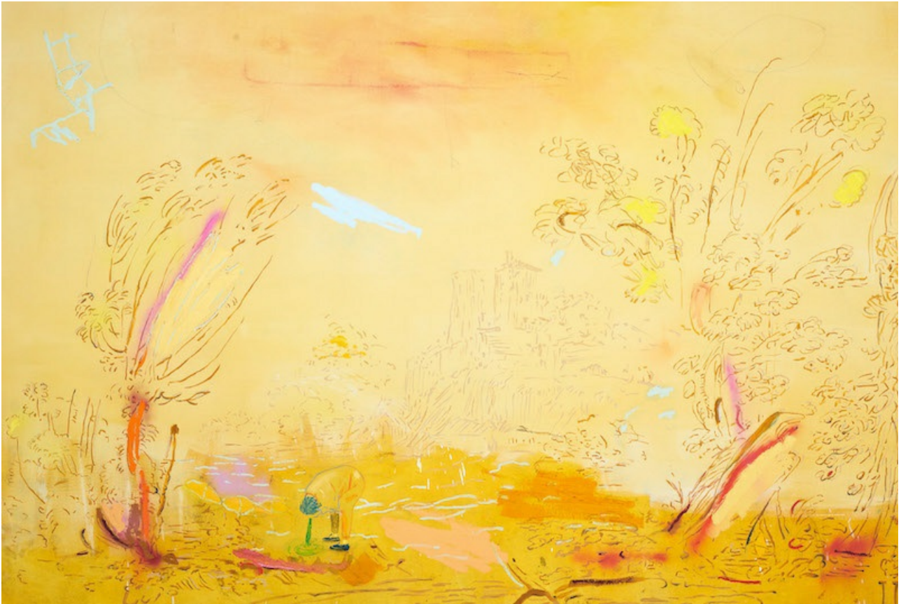
He sees a picture on the floor , 2015. Acrylic spray paint, oil stick, oil. 60 x 84 inches.