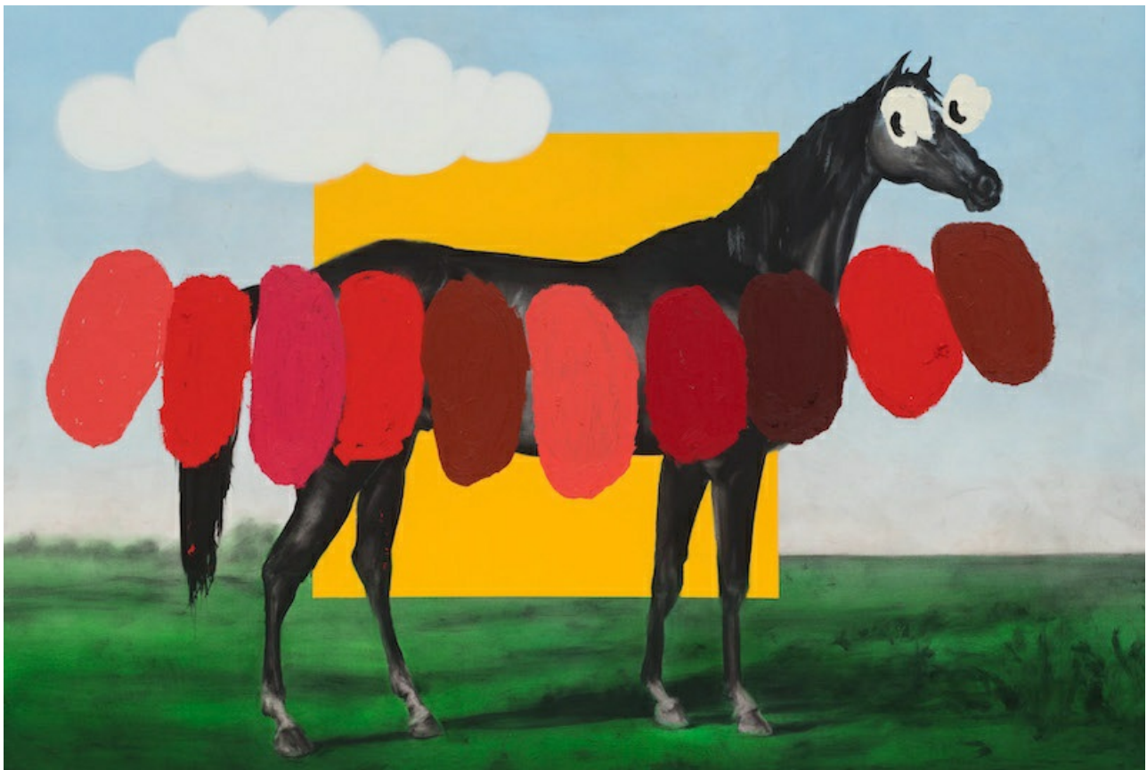
The secrets of happiness, death, love , 2017. Oil, oil stick. 60 x 84 inches.

Recently, we've been exploring the meaning of "worst" as a concept. We're asking ourselves questions like: Instead of aiming to be the best, what would it look like if our ambition was to be the worst? It's a pretty freeing idea, creatively. It takes the pressure off making something perfect and gives us a playground for debate, creating things, and just having fun.