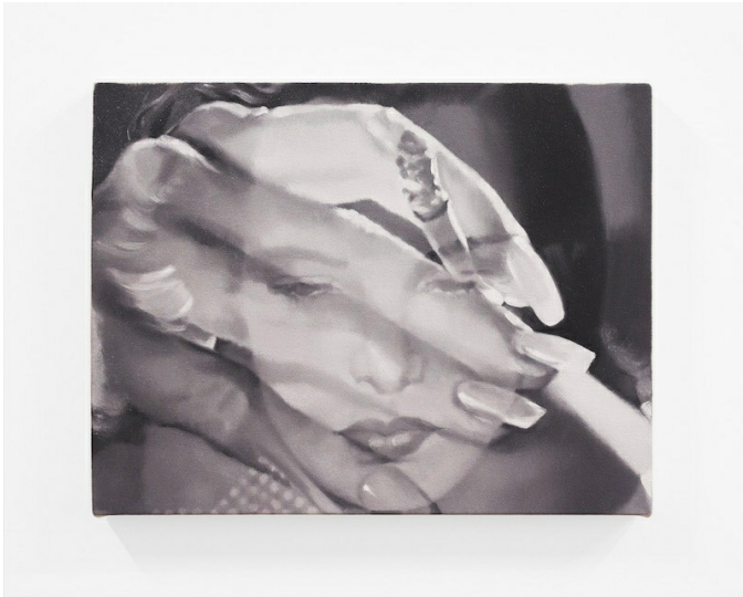
Confessions , 2023, 14x18 inches, oil on canvas

So there's this preparatory work that you do, sourcing imagery and composing it online, but then the actual moment of painting is very instantaneous and intuitive.