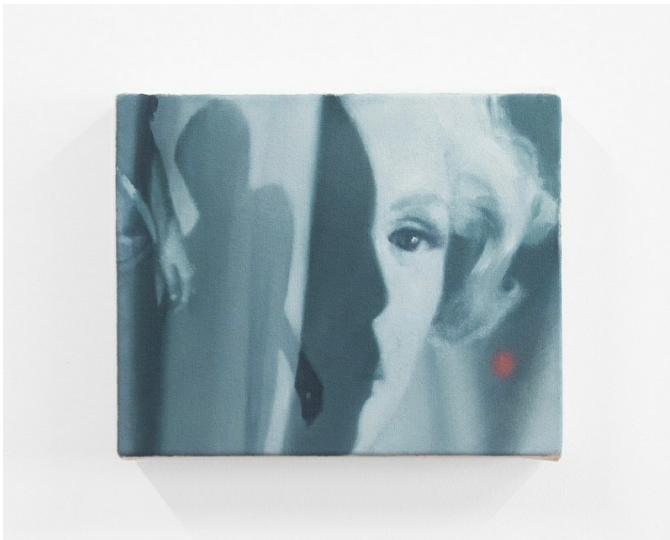
Curtain , 2022, 8x10 inches, oil on canvas

I am always working out something unconscious in the paintings: how I relate to people, how people relate to me, how I relate to the culture and how I relate to the past.