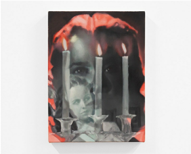
Dinner Party , 2023, 16x12 inches, oil on canvas

Is there a point where you abandon the digital workflow in order to focus on the painting? Is that a conscious shift for you?