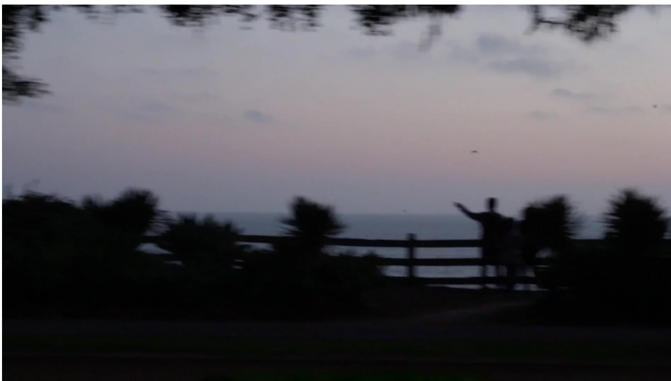
Marco Kane Braunschweiler, One Wilshire to Ocean Avenue , 2015, HD video, dimensions variable

MKB: I think about the car or skateboard as a dolly. They're the best way to do the valuable work of documenting the cities' constantly changing architecture and planning. Architecture, like film, is a document of social history--reading it reveals so much about how we live. There's not a lot of documentation of city architecture outside of Google Street View, whose authorship is part of a pantheon of corporate surveillance, which is not visually interesting to me. It feels really ominous when I see the vernacular sign rendered by Street View.