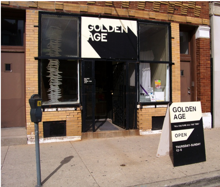
Exterior of Golden Age