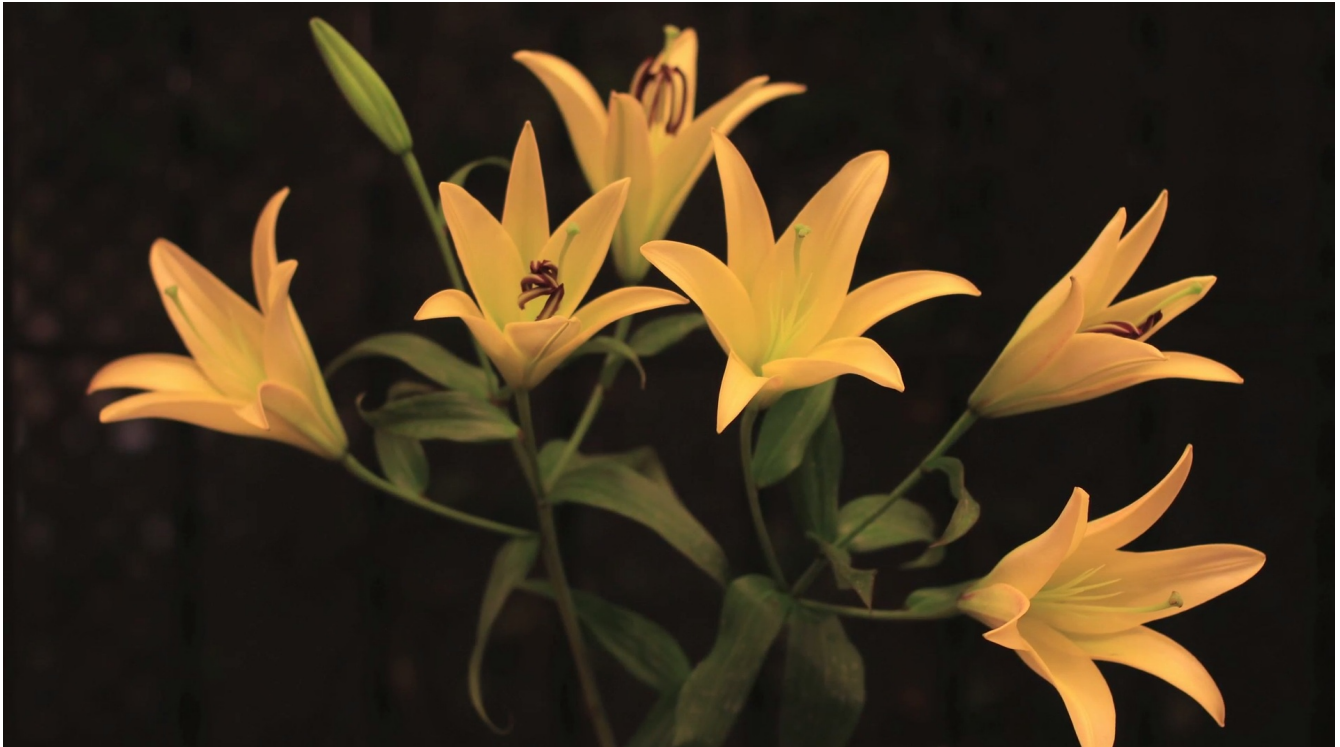
Timelapse 12, 2014, HD video, dimensions variable