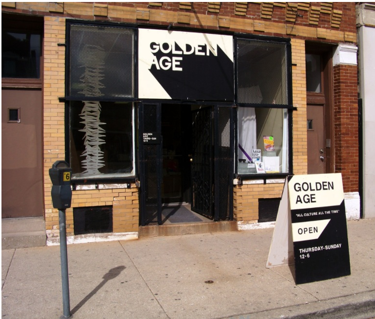
Exterior of Golden Age