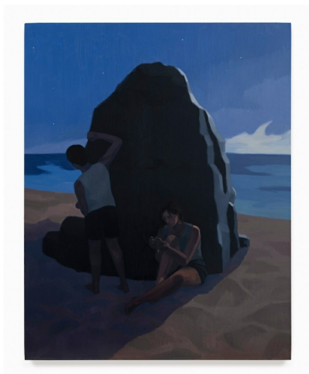
Lost in Translation , 2023, oil on linen, 60 x 48 inches

And the third hat is the philosopher hat, which I wear when I think deeply about why this work needs to exist in this world. It's about my emotions and my story, but how is it going to help other people? What can other people get from it? Where does this work exist in this world?