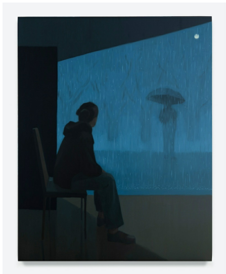
Eight Thousand Layers , 2023, oil on linen, 60 x 48 inches

I definitely think I insisted on some stuff that probably isn't very strategic career-wise. I turned down some shows. It's just what I had to do. I moved out of my New York studio, too. I moved to a Jersey City studio. I didn't move to Brooklyn. One of the reasons besides rent, was so that I could get some distance. I could hide out in Jersey City like a hermit. When I want to go into Manhattan and socialize, I can, but for my studio, I'm protecting it. I turn down studio visits when I'm not ready, because I know whatever they say, it's going to get to my head.