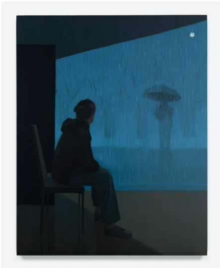
Eight Thousand Layers , 2023, oil on linen, 60 x 48 inches

I definitely think I insisted on some stuff that probably isn't very strategic career-wise. I turned down some shows. It's just what I had to do. I moved out of my New York studio, too. I moved to a Jersey City studio. I didn't move to Brooklyn. One of the reasons besides rent, was so that I could get some distance. I could hide out in Jersey City like a hermit. When I want to go into Manhattan and socialize, I can, but for my studio, I'm protecting it. I turn down studio visits when I'm not ready, because I know whatever they say, it's going to get to my head.