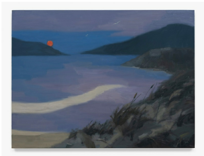
Blood Sun , 2023, oil on linen, 30 x 40 inches

The paintings originate from my experience, but they're not about my experience. I'm not illustrating what I went through. I'm creating a space to process what I'm feeling, and hopefully the viewers, when they see the paintings, can resonate with that, but they don't need to know my origin story. They don't need to know where I have lived. I don't think that's necessary or helpful.