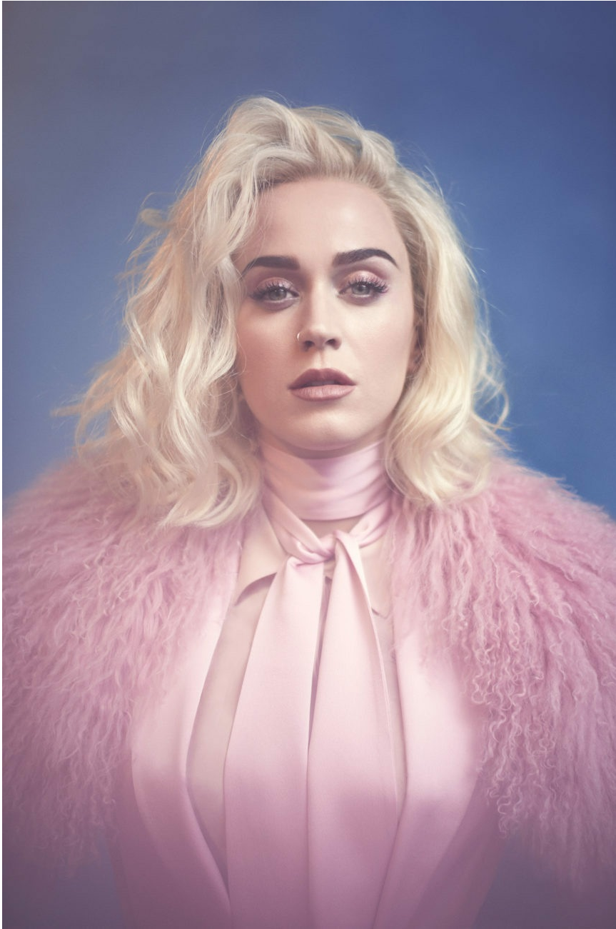
Katy Perry (Chained to the Rhythm), 2017

Even when you're on set with someone for an hour, you do get to know them a little bit. It's obviously not the same as photographing the same person for five years or 10 years. I've been photographing my brother for almost probably since he was five.