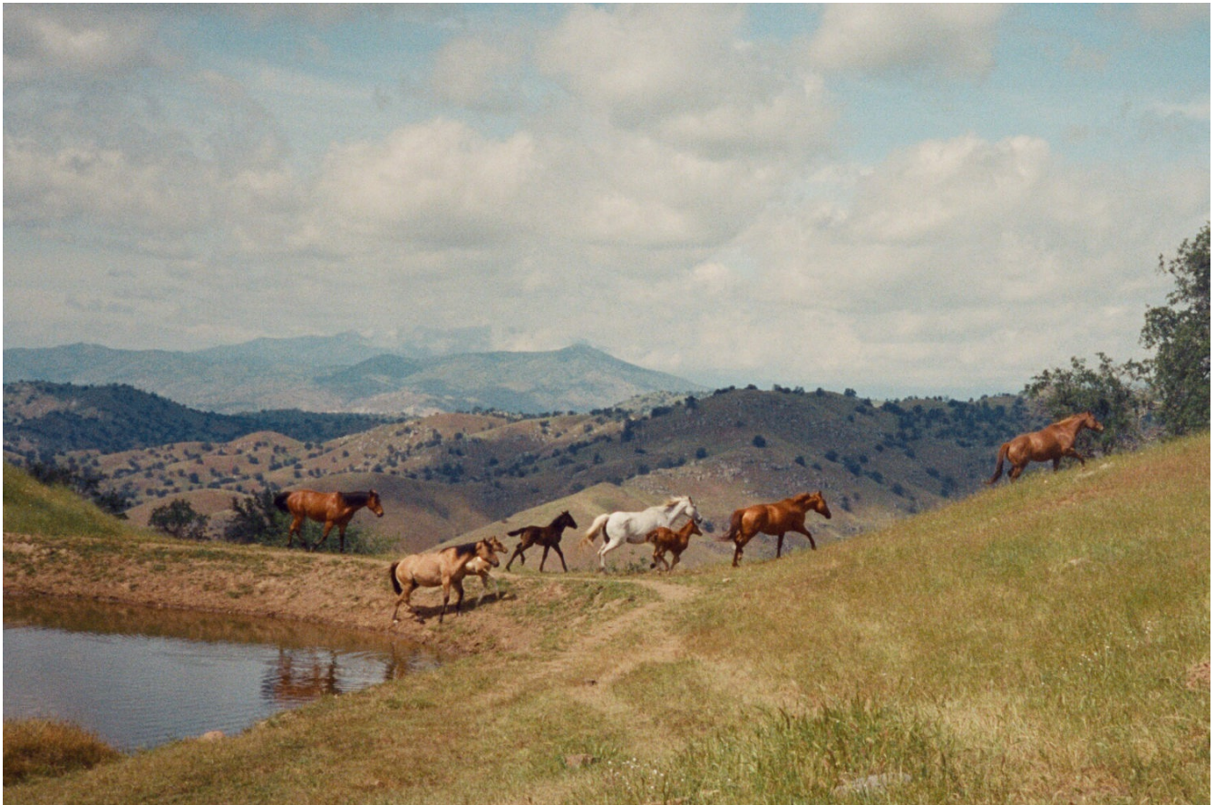
Portrait of the American West, 2017

I was 12 when Flickr came out. That's when good photographers were on Flickr. I think good photographers are still on Flickr, though I'm not really sure. It's more Instagram now. The way I did it was I just put a bunch of shit on the internet and then shamelessly self promoted it. You kind of have to do that. First you have to focus on photographing what you love and figuring out how that translates, but I would just say take a lot, a lot, a lot of pictures and then don't be afraid to put them everywhere. Do whatever you need to do to do what you want to do.