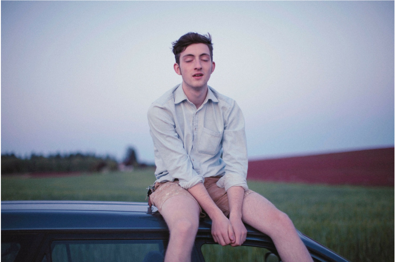
Boy (Adrift, Fleeting), 2012

being able to keep that door open, like letting it become whatever it wants to be, is important because projects have a life of their own. You make something, but it'll tell you what it is. It's just going into that space of what your art wants to be and how it's going to reveal itself to you.