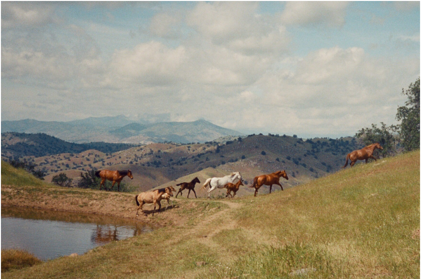
Portrait of the American West, 2017

I was 12 when Flickr came out. That's when good photographers were on Flickr. I think good photographers are still on Flickr, though I'm not really sure. It's more Instagram now. The way I did it was I just put a bunch of shit on the internet and then shamelessly self promoted it. You kind of have to do that. First you have to focus on photographing what you love and figuring out how that translates, but I would just say take a lot, a lot, a lot of pictures and then don't be afraid to put them everywhere. Do whatever you need to do to do what you want to do.