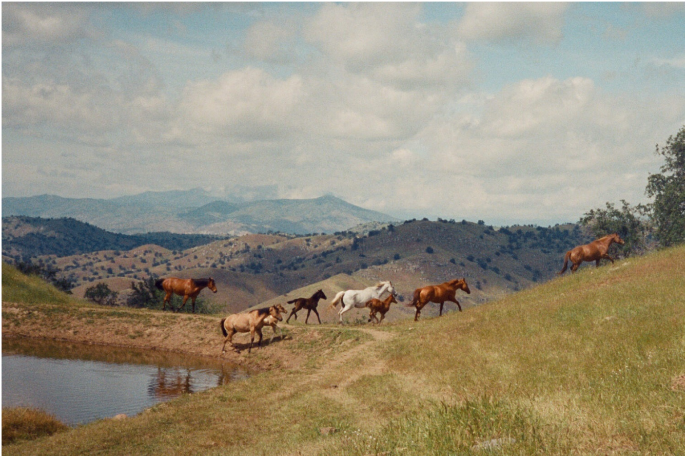
Portrait of the American West, 2017

I was 12 when Flickr came out. That's when good photographers were on Flickr. I think good photographers are still on Flickr, though I'm not really sure. It's more Instagram now. The way I did it was I just put a bunch of shit on the internet and then shamelessly self promoted it. You kind of have to do that. First you have to focus on photographing what you love and figuring out how that translates, but I would just say take a lot, a lot, a lot of pictures and then don't be afraid to put them everywhere. Do whatever you need to do to do what you want to do.