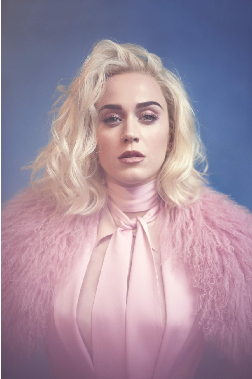
Katy Perry (Chained to the Rhythm), 2017

Even when you're on set with someone for an hour, you do get to know them a little bit. It's obviously not the same as photographing the same person for five years or 10 years. I've been photographing my brother for almost probably since he was five.