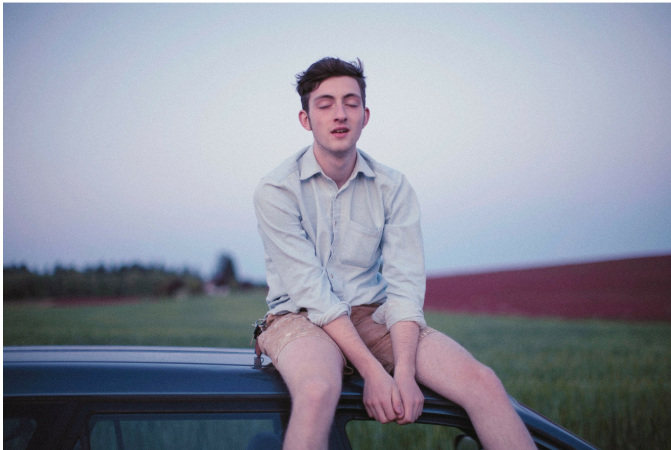
Boy (Adrift, Fleeting), 2012

being able to keep that door open, like letting it become whatever it wants to be, is important because projects have a life of their own. You make something, but it'll tell you what it is. It's just going into that space of what your art wants to be and how it's going to reveal itself to you.