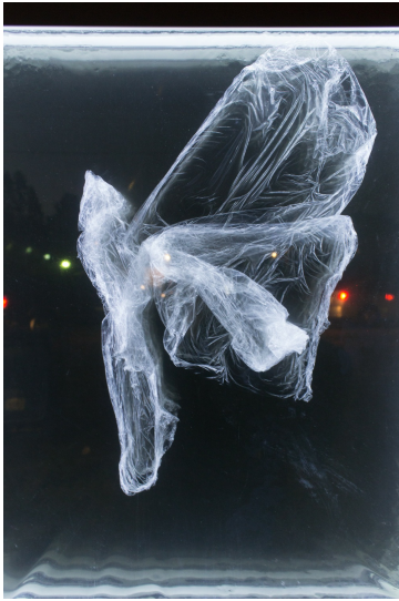
True Butterfly, 2016. One-way mirrors, LED lights, plastic film, display case at Chin's Push, Los Angeles.