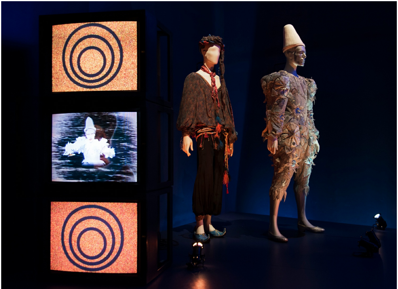
David Bowie is, March 2, 2018 through July 15, 2018, installation view.

Back in the '80s we were definitely using maquettes and sizing all of the images and moving them around on walls and stuff. A lot of the work I've done here at the Brooklyn Museum has been in the computer, but occasionally you do work with a curator that wants to have a model. You have to take a minute to remember, "Oh my god. How do we make those?"