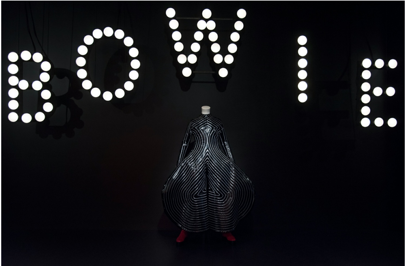
David Bowie is, March 2, 2018 through July 15, 2018, installation view.