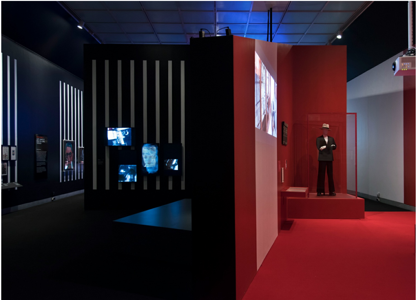
David Bowie is, March 2, 2018 through July 15, 2018, installation view.

they offered me a job in the film and video department and that's how my career started in museums. I highly recommend doing an internship, mostly just as a way to find out what you like and what you're good at. You might surprise yourself. Back when I was in school you didn't see much offered in the way of exhibition design, but now there are lots of courses about designing art exhibitions. It's a field that has really boomed over the past couple of years, which makes me happy.