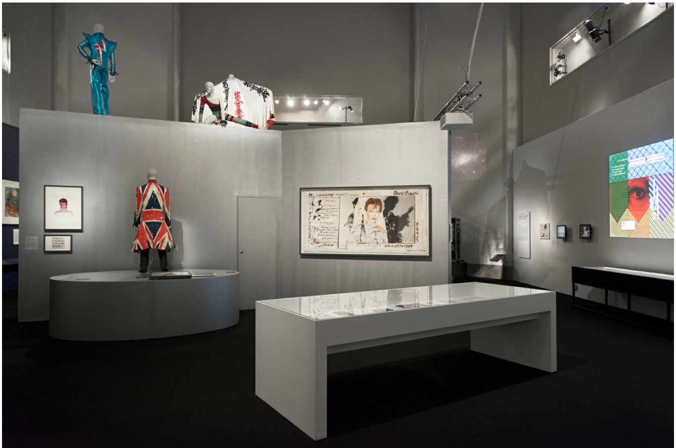
David Bowie is, March 2, 2018 through July 15, 2018, installation view.

Different shows have different personalities. You have to think about the kind of mood that you're setting. I find that a lot of times when people are really excited to come and see a big exhibition, they almost want extra material right at the beginning. Sometimes you want to front-load a show so that people feel like they get enough history before they get too far into it.