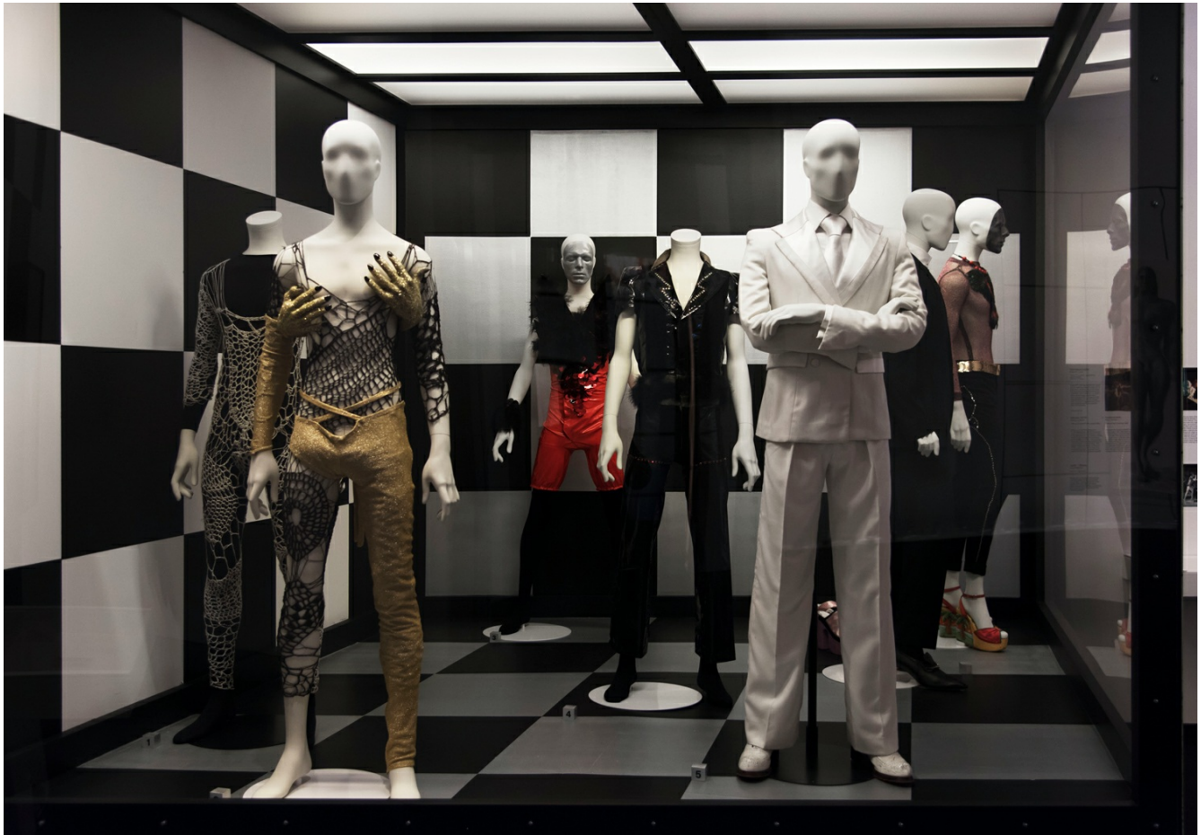
David Bowie is, March 2, 2018 through July 15, 2018, installation view.

When I first found out that we were going to do the project, I spent a lot of time with the exhibition checklist, which tells you about all of the items it will include. The show had been on a tour around the world and Bowie had always hoped the tour would end in New York. It has had a long history already. I had already seen two versions of it over the years. Even though I'd seen it, it still takes a while to make sense of all the material. There are over 400 pieces in the show. I'm also a huge Bowie fan, so there was that as well.