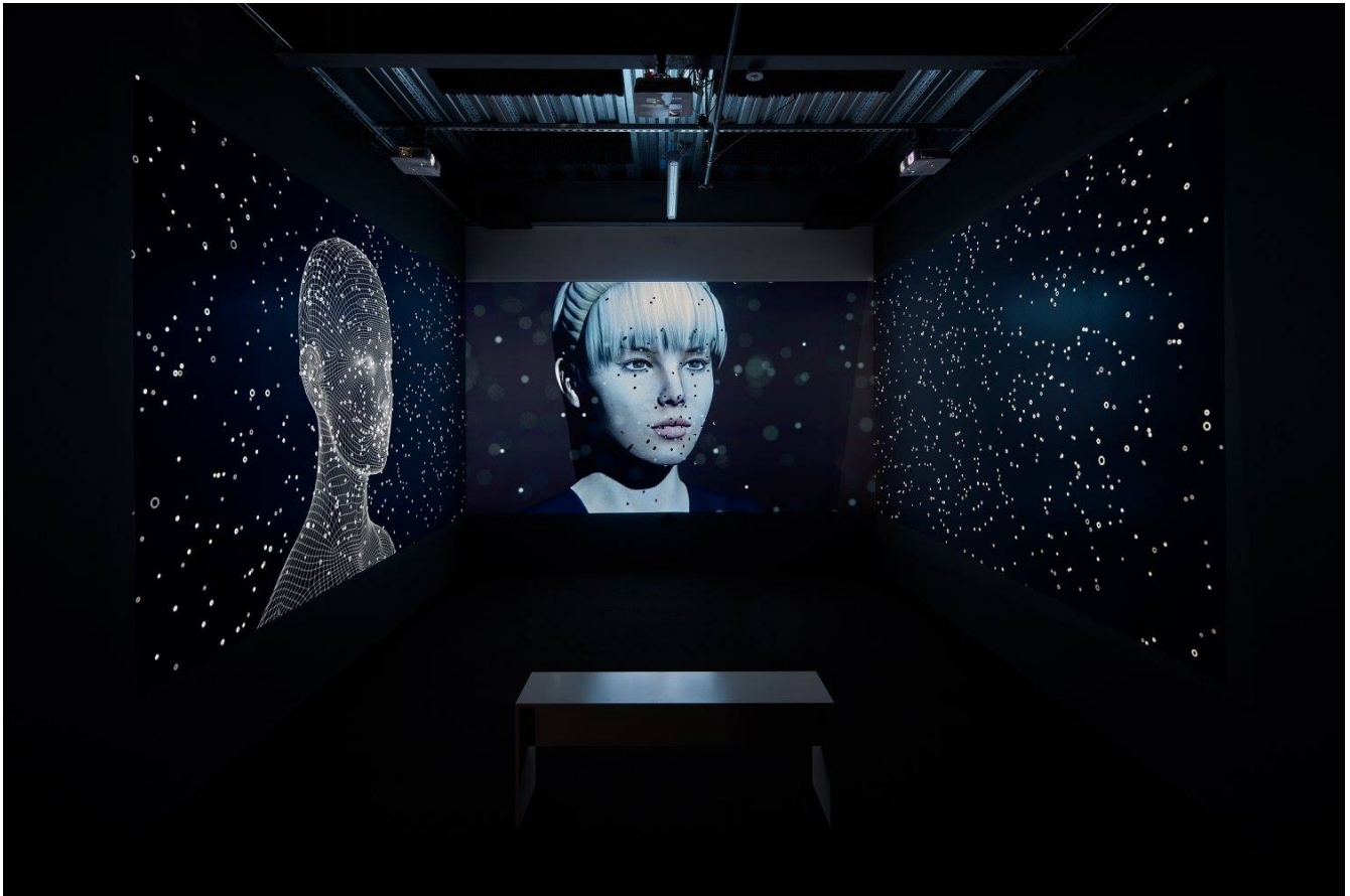
ID, 2015. (three-channel installation view) TRANSFER DOWNLOAD , Minnesota Street Project, San Francisco

Knowing that your work is your life, how do you edit your own work?