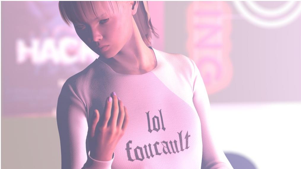
SITTIN' UP IN MY ROOM, 2018

Carly Rae Jepsen - Emotion ~ You can just play this on repeat during all activities.