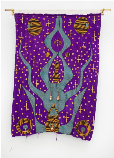
JOJO ABOT, Dzidzor (Joy, Happiness) , 2023, textile, acrylic, clay, 63 x 42 in. (160 x 106.7 cm)

Can you talk about the title of the exhibition, "A GOD OF HER OWN MAKING"?