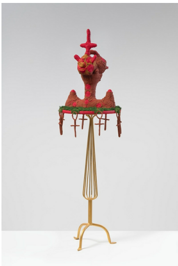
JOJO ABOT, Three heads are better than one 2023, clay, foliage, metal, 52 1/2 x 17 x 17 in. (133.4 x 43.2 x 43.2 cm)

You seem to have such a strong iconic connection to self, what allowed you to access this while also entering a realm of sharing with others?