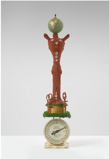
JOJO ABOT, Weight of the world 2023, clay, shells, wood, paper, foliage, metal, 34 x 7 x 8 1/2 in. (86.4 x 17.8 x 21.6 cm)