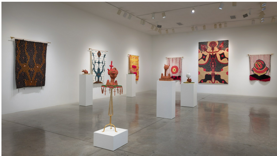
'A GOD OF HER OWN MAKING' installation

True and actionable freedom and liberty for all