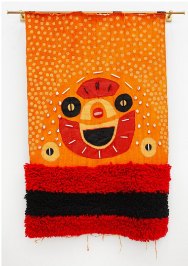
JOJO ABOT, Kpo Nkunyeme , 2016, bogolan, acrylic, yarn, 63 x 42 in. (160 x 106.7 cm)

For this exhibition we did an all-acoustic version of the opera. With sound, people can walk away with it. People can take fragments with them whether it is embedded in their DNA, shows up in a dream as part of their spiritual code or they might find themselves humming it. It's something that can belong to all of us and none of us at the same time.