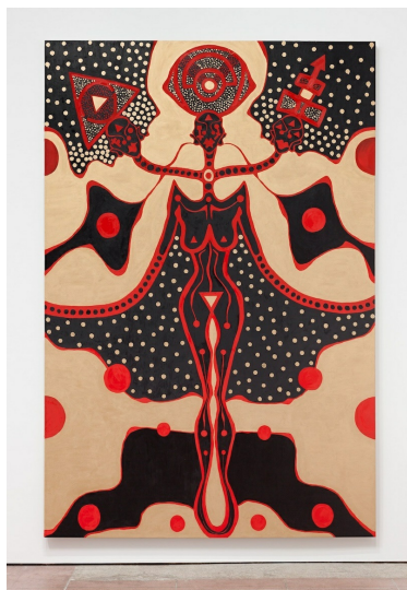
JOJO ABOT, Ta Kpe Kpe , 2020, oil on canvas, 110 x 74 in. (279.4 x 188 cm)

How can this philosophy be applied to the tangible: architecture, design, education, how we eat, politics, and the church or synagogue? How can we affirm life?