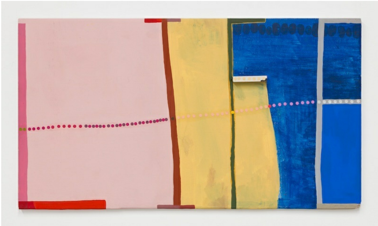
Hannah Tishkoff, L.I.F.E. (Line In Forward Exploration) , 2026, acrylic, oil, flashe, and collage on found wood, 15 x 27 x 1 in., 38.10 x 68.58 x 2.54 cm.