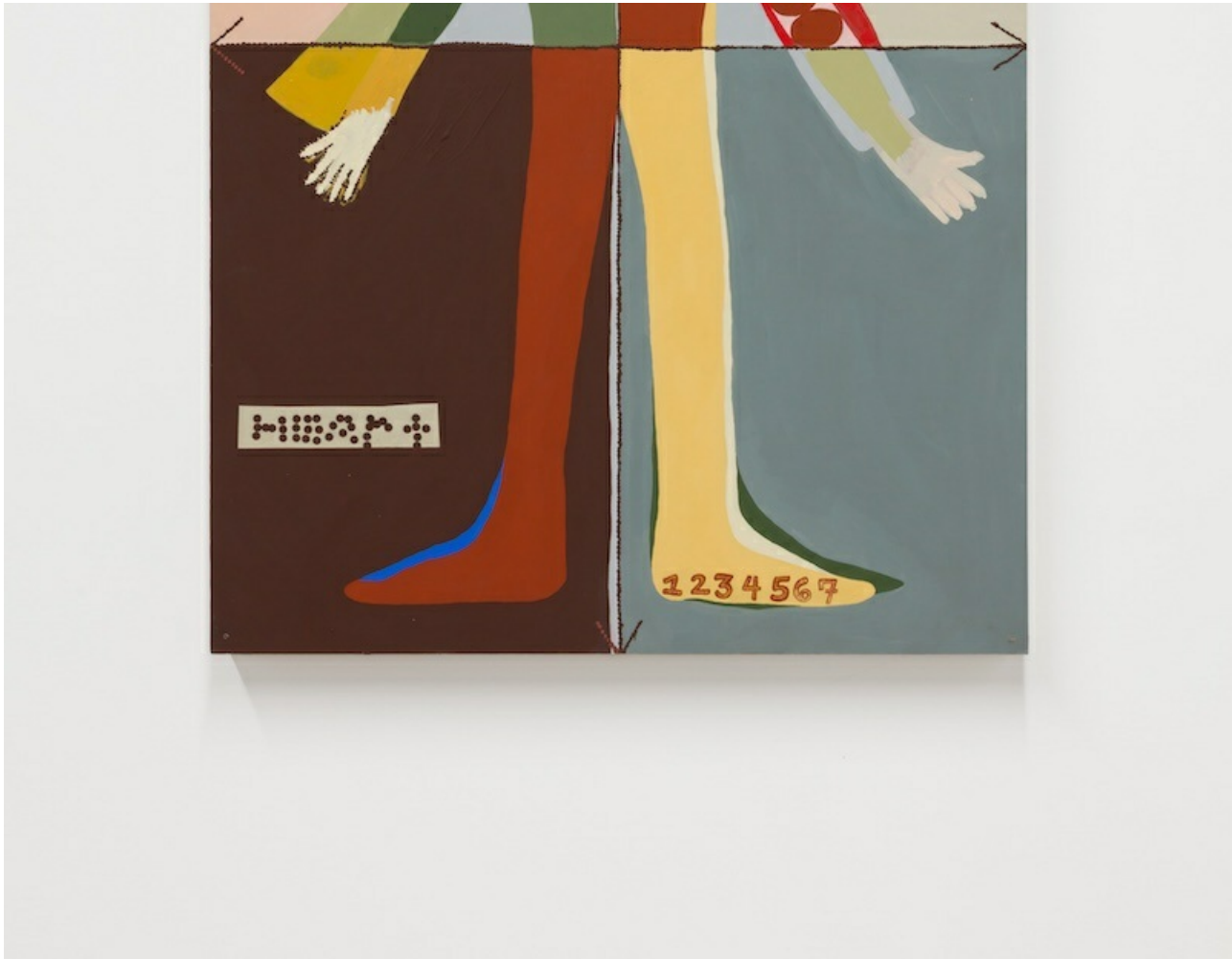
Hannah Tishkoff, The Shape of Things To Come , 2026, flashe, acrylic, oil, and paper on Masonite mounted on panel, 36 x 24 in., 91.44 x 60.96 cm.

Are there connections between your teaching background and your art?