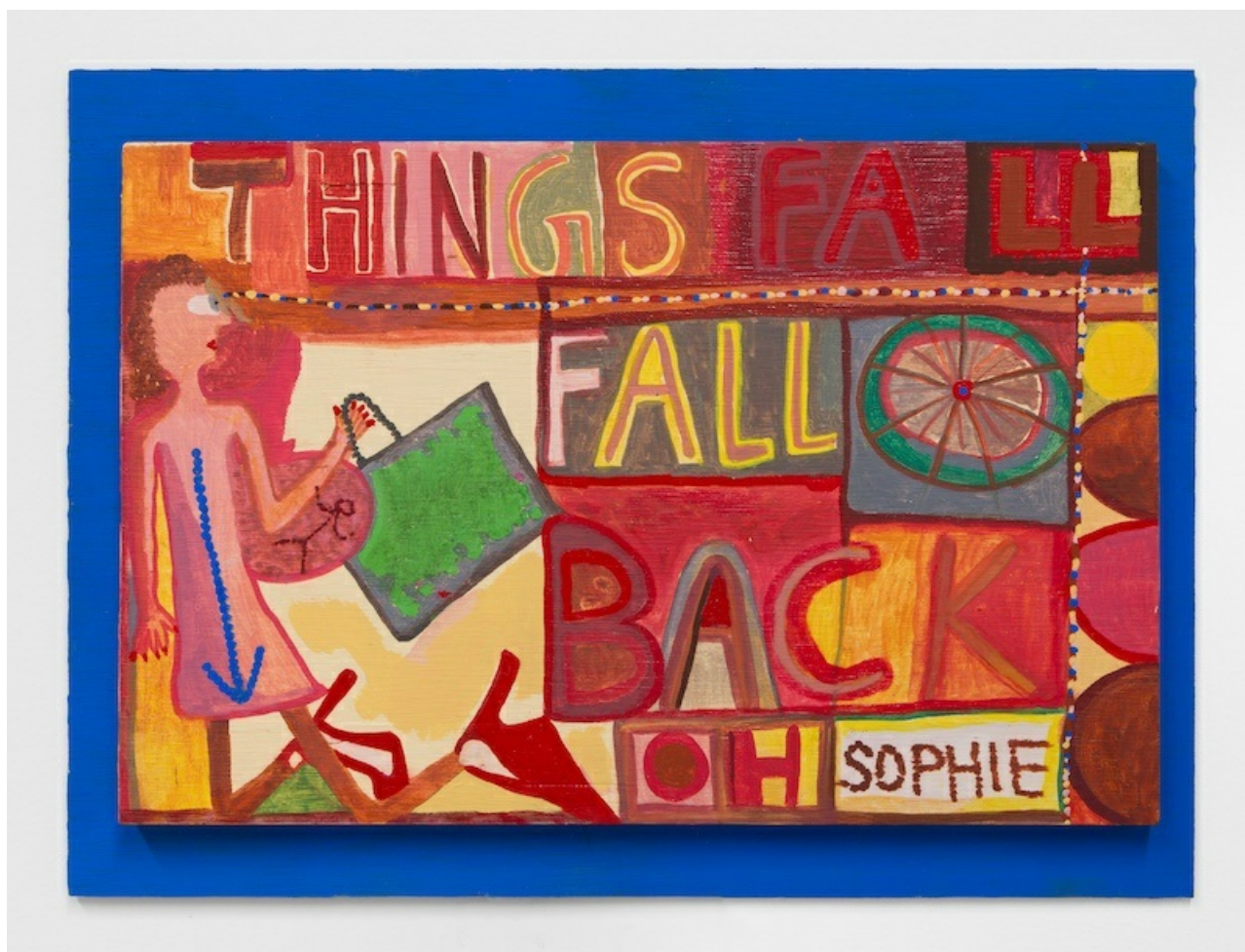
Hannah Tishkoff, Things Fall Back , 2026, oil, flashe and acrylic on found wood, 10 x 13 x 1.5 in., 25.40 x 33.02 x 3.81 cm.

It's a tragedy when art becomes impossible because it's also so easy. Art is so normal. It's the least crazy thing to do. It's hard not to make value judgments between those two experiences when you're thinking, "I've hit my stride. I found my way. This is better than when I was lost in the dark." But you only know what light is in relationship to that darkness.