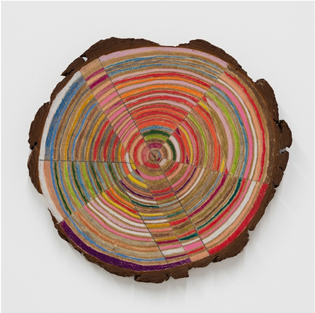
Hannah Tishkoff, Beginning of a Poem , 2026, colored pencil on found wood, 9 x 9.5 x 1 in., 22.86 x 24.13 x 2.54 cm.