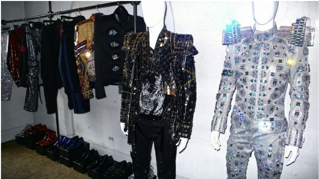
Costumes designed for Michael Jackson's THIS IS IT Arena Tour

I really like collaboration, so I always try to make that happen, but it's shocking to some people. They're literally used to being part of a machine and beholden to one person to make all their decisions for them. I'm not into that at all. You all need to have a certain feeling that's shared for the success of the piece. It shouldn't be an impersonal project for any one person along the line, everyone should feel that they have some stake in it.