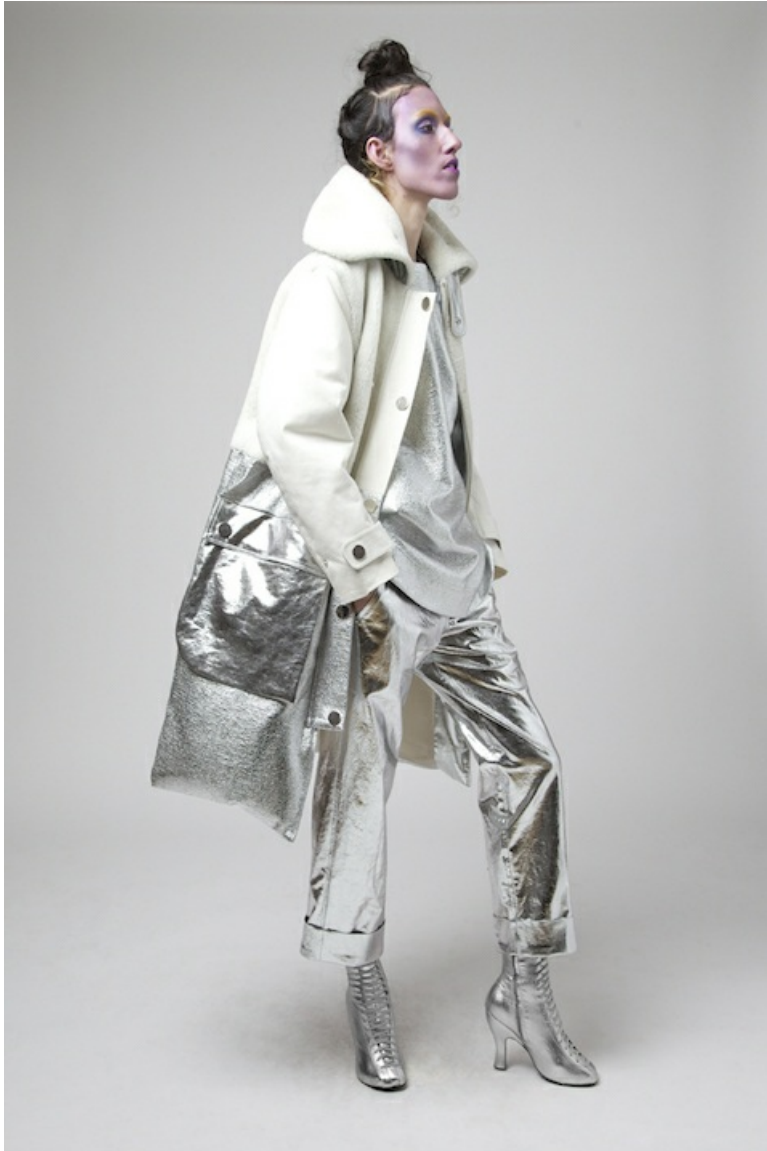
ZALDY, Fall/Winter 2016

It must present an interesting challenge—designing something that you can perform in, as opposed to designing something that only has to move down a red carpet.