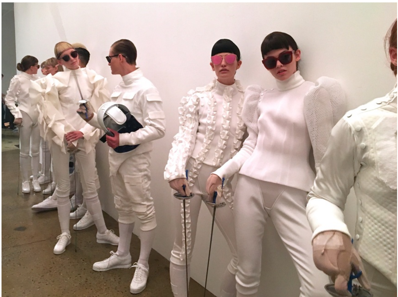
GENTLE MONSTER Spring 2017 NYFW

This is an interesting time for those of us who work in this world. The perception of what a designer does has changed with Project Runway , with social media, with all of that stuff that promotes the imagined glamour of being a designer. I don't think you'll meet anybody in fashion school that's like, "Oh, I want to be a pattern maker." Or, "I want to be a master tailor." Nobody thinks like that now. Everybody wants to be the star, and the reality is that not everyone is really equipped to take that position on. Kids see that someone like Kylie Jenner is suddenly saying, "Oh, I'm going to design a collection," and of course it sells out, because it's based on something else. It's based on existing fame. But that's it. Everyone thinks it's somehow easy to do this—I'll just design my own collection—and it's not. It's complicated. It costs a lot of money and there are complicated politics and it's really involved. And it's really not that glamorous.