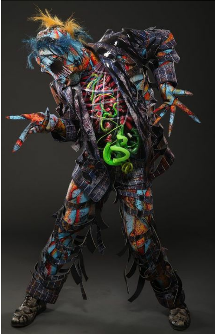
Costume for Michael Jackson themed show by Cirque du Soleil, MJ ONE

Road trips! There are so many incredible places to see in America—Monument Valley, Bryce Canyon, White Sands New Mexico, Zion, Yosemite, Grand Canyon, Joshua Tree, Valley of Fire, Big Sur—and the best are the places you find along the way that you just can't plan in advance. Spontaneous wandering with the right company and Lana Del Rey singing in the background is the best.