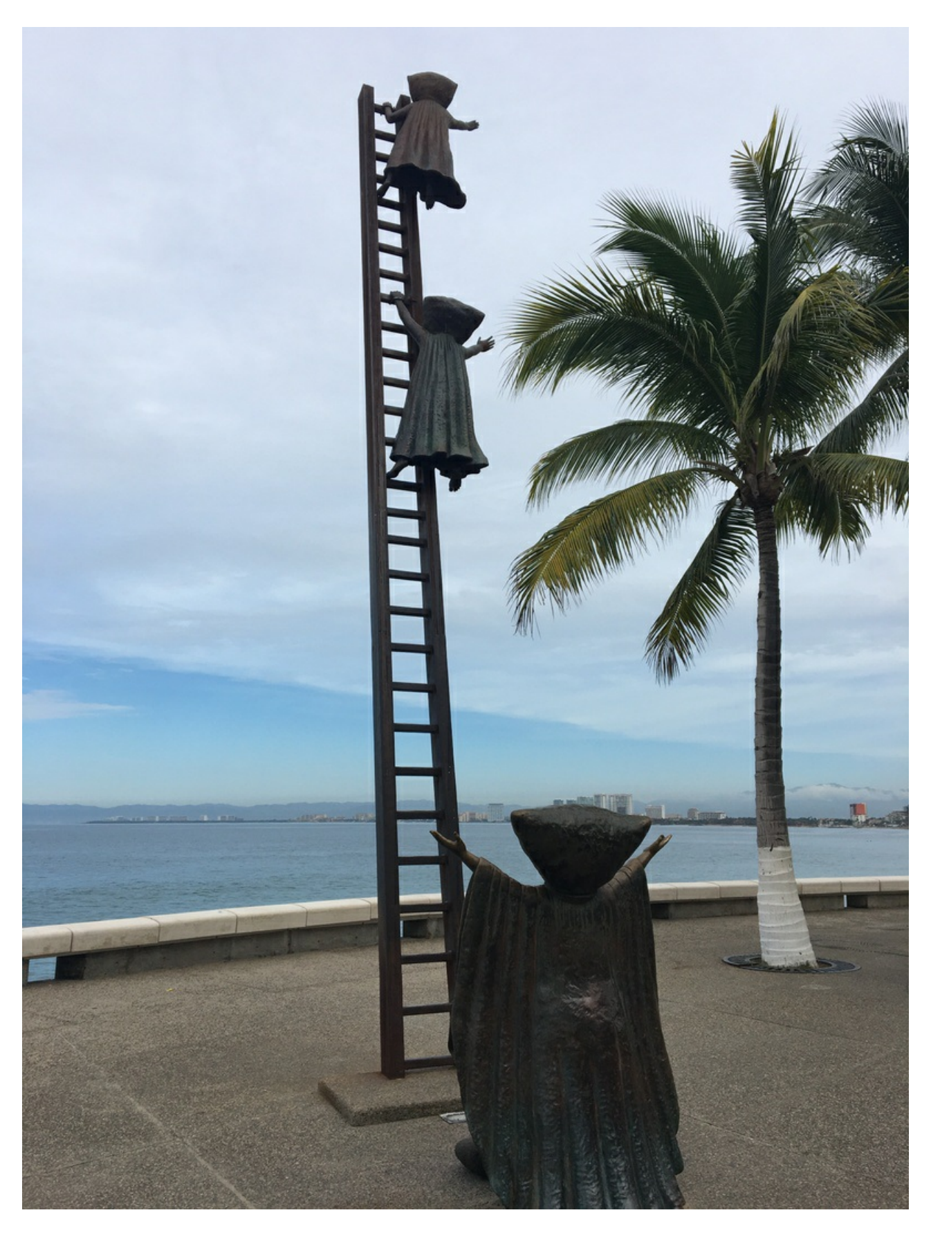
Searching\ for\ Reason\ by Sergio Bustamante, on the boardwalk in Puerto Vallarta, MX