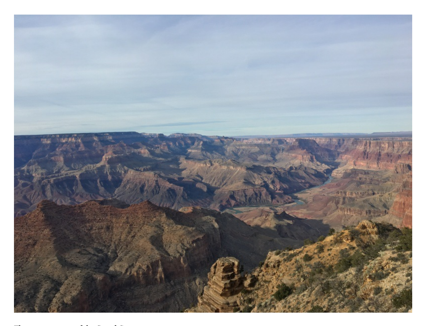
The great expanse of the Grand Canyon.