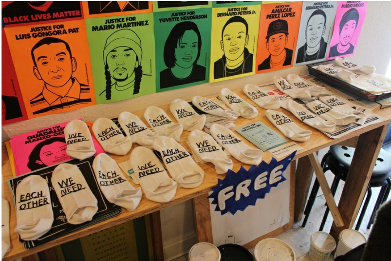
Free screen-printed socks by artist Carissa Potter.

Through that project, we weren't arguing for artists to take up this model in all their work. Rather, it was an experiment to see how visually loud we could be, collectively. What we found is that inviting people to take direct inspiration from someone else's work accomplished what we wanted it to: it inspired them to make things when they wouldn't have otherwise, and dissolved the pressure to be original enough to draw out their own ideas.