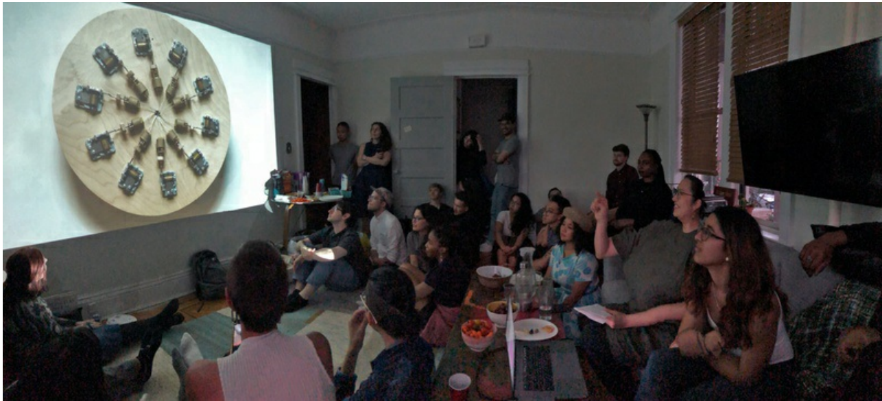
A Living Room Light Exchange event

Curating LRLXNY got me motivated again because it was something to do and somewhere to be. But it also helped me think through my own needs as a writer and creative person. I've found that, sometimes, locating creative community is as easy as consistently showing up to a crowded coffee shop. Other times, it requires deliberately building out a structure of engagement with those around you that benefits everyone involved.