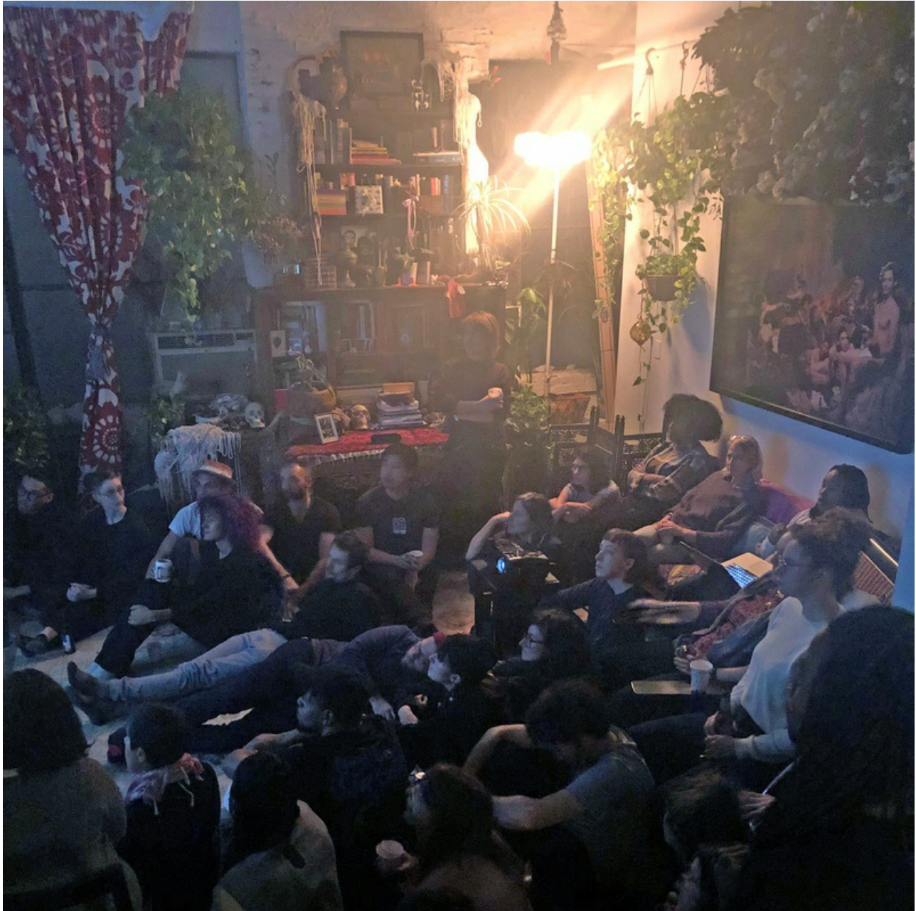
A Living Room Light Exchange event; Image courtesy Sarah Burke.