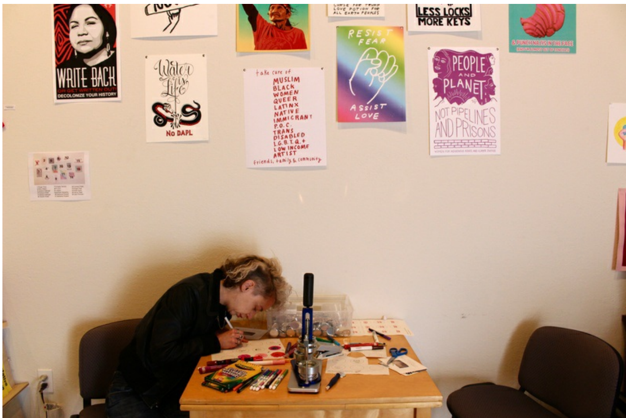
Anti Lab.